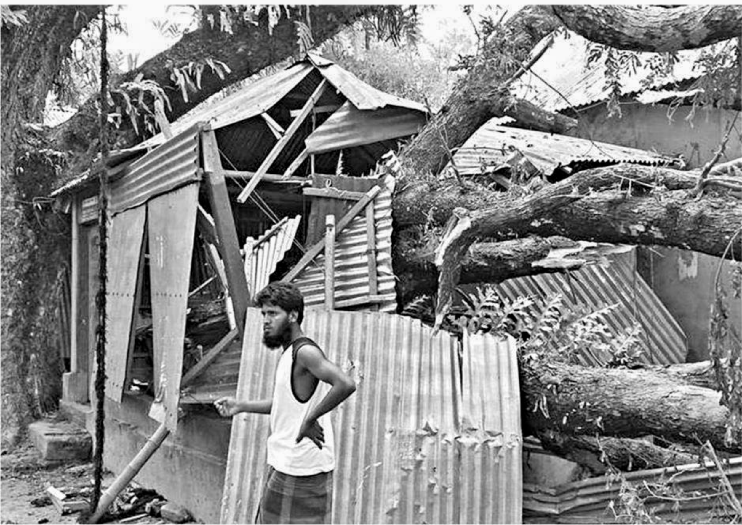
Houses lie mangled and trees uprooted at Joy Bangla Bazar in Tarati union of Muktagachha upazila under Mymensingh district as a nor'wester lashed the area on Wednesday night.