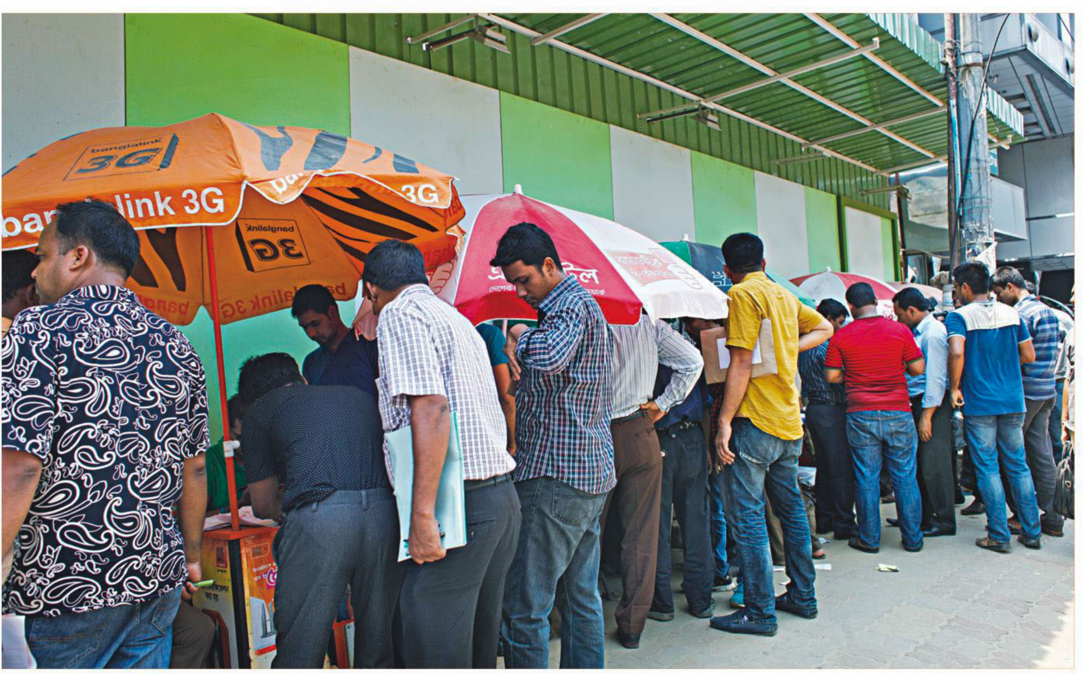
People flock to various telecom operators' stalls set up on a footpath near the capital's Gulshan-1 intersection yesterday, as tomorrow is the last day to complete SIM re-registration biometrically. The last minute rush is also proving to be cumbersome for the operators, who sought more time from the authorities.