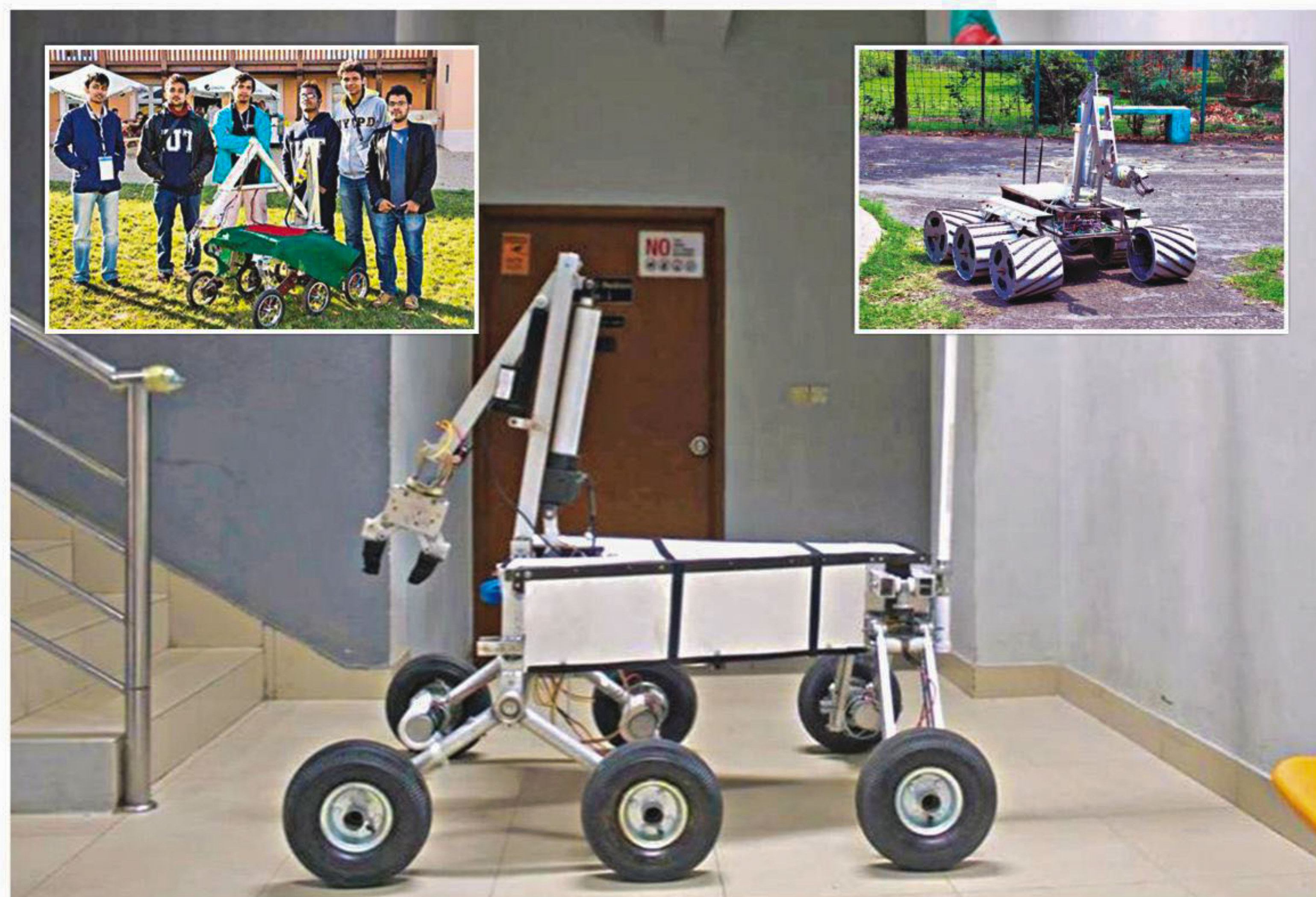
The rover designed by the members of AIUB Robotic Crew. The AIUB team and two other Bangladeshi teams have reached the field competition level of University Rover Challenge 2016. Top left, members of IUT Mars Rover team with their rover and top right, the rover built by a Buet team named Interplanetar.