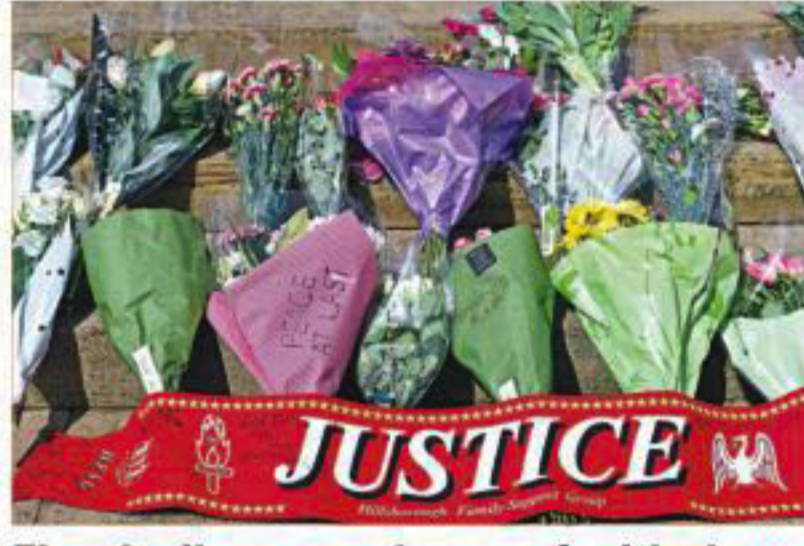
Floral tributes and a scarf with the word Justice are laid on the steps of St George's Hall in Liverpool yesterday.