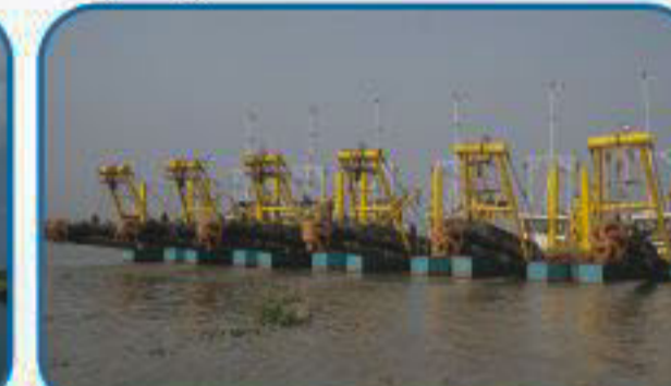
6 Nos. Cutter Suction Dredger450mm for BIWTA