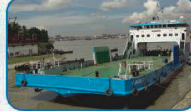
K-Type Ferry For BIWTC