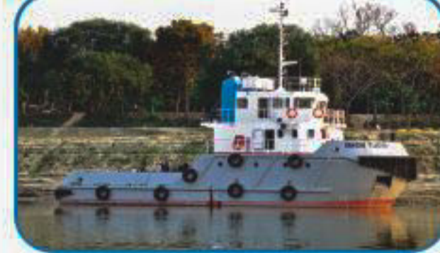
Sea going Harbour Tug Boat-15 BWDB