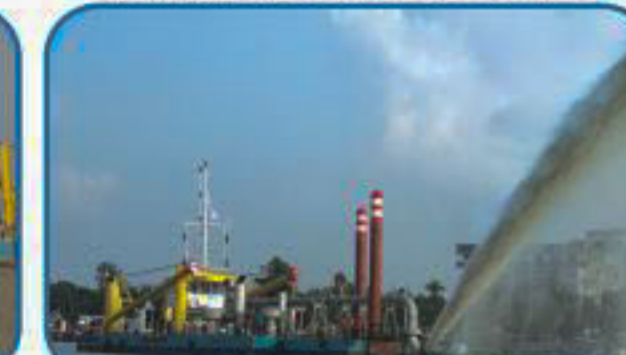
2 Nos. Cutter Suction Dredger650mm for BWDB

Office : 944/A, Strand Road, Majhirghat, Chittagong-4000 Shipyard: Ichanagar, Karnafuly, Chittagong, Bangladesh.