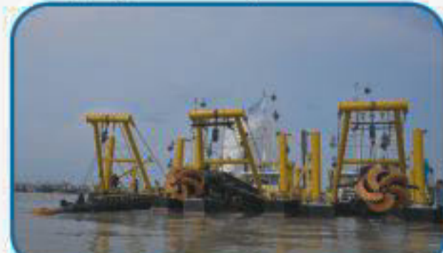
03 Nos. Cutter Suction Dredger-450mm for BIWTA