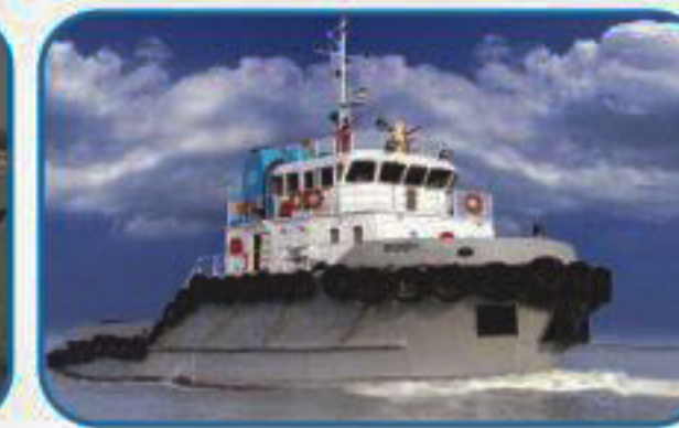
Sea going Harbour Tug Boat-KANDARI-7