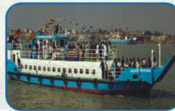
Sea Truck For BIWTC