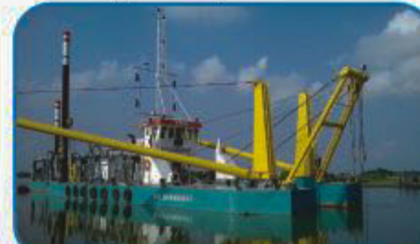
2 Nos. Cutter Suction Dredger500mm for BWDB