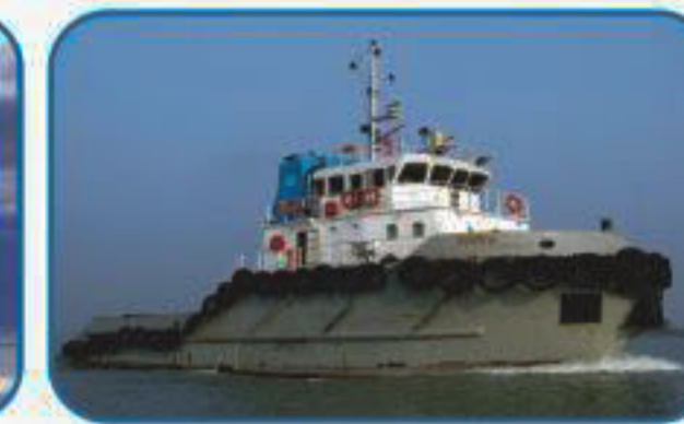
Sea going Harbour Tug Boat-KANDARI-8