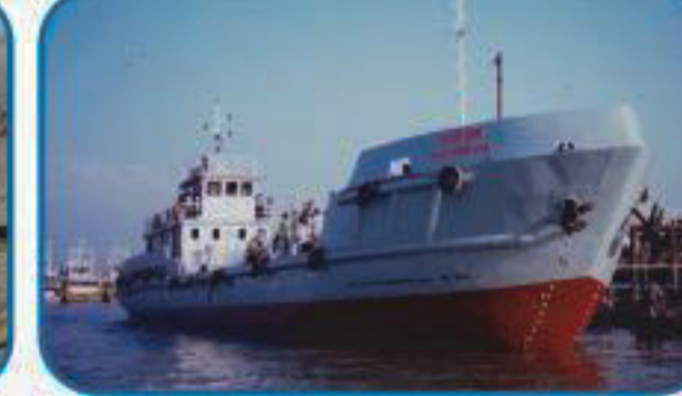
Sea going Water Tanker M.V Trishna