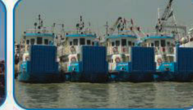
4 Nos. Sea Truck For BIWTC