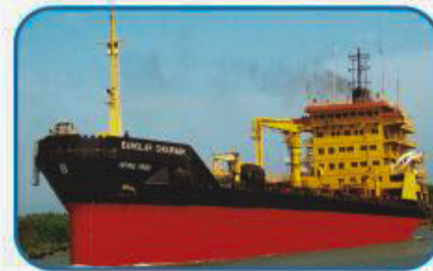
M.T Banglar Shourabh Re-constructed for BSC