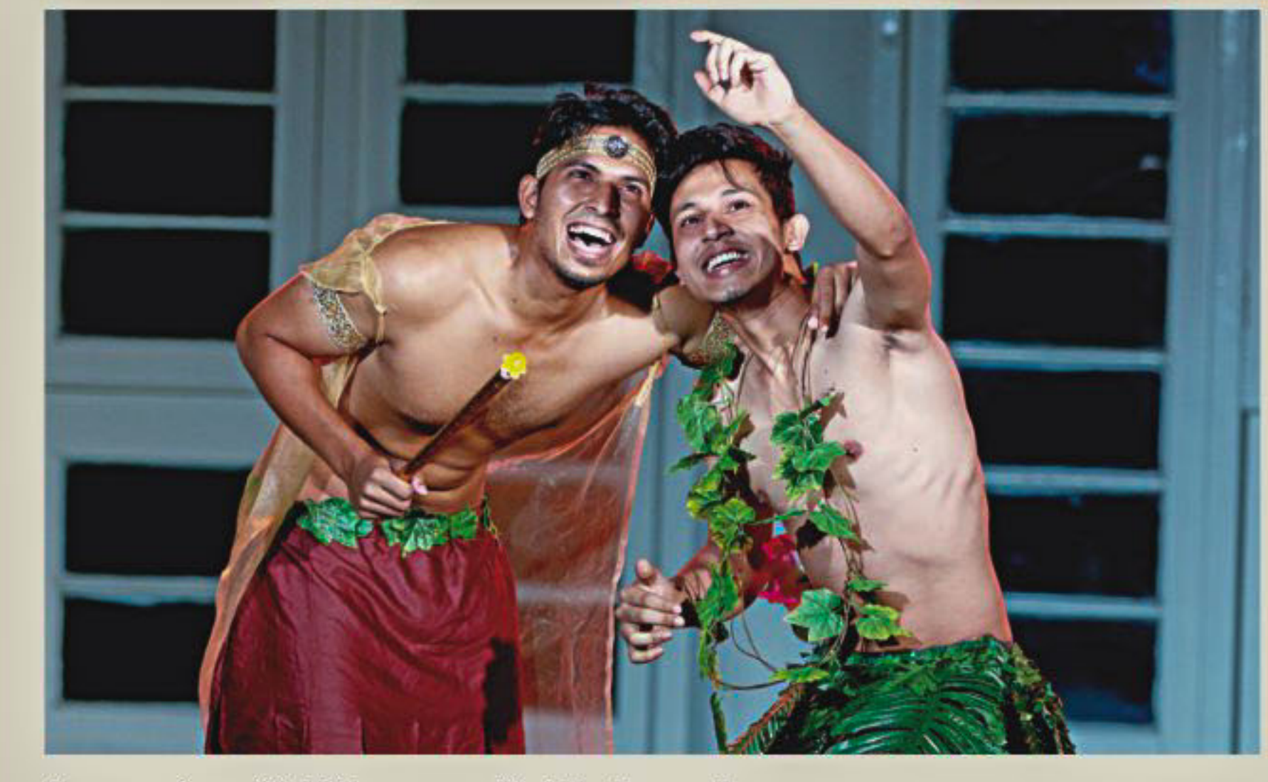
A scene from "A Midsummer Night's Dream".