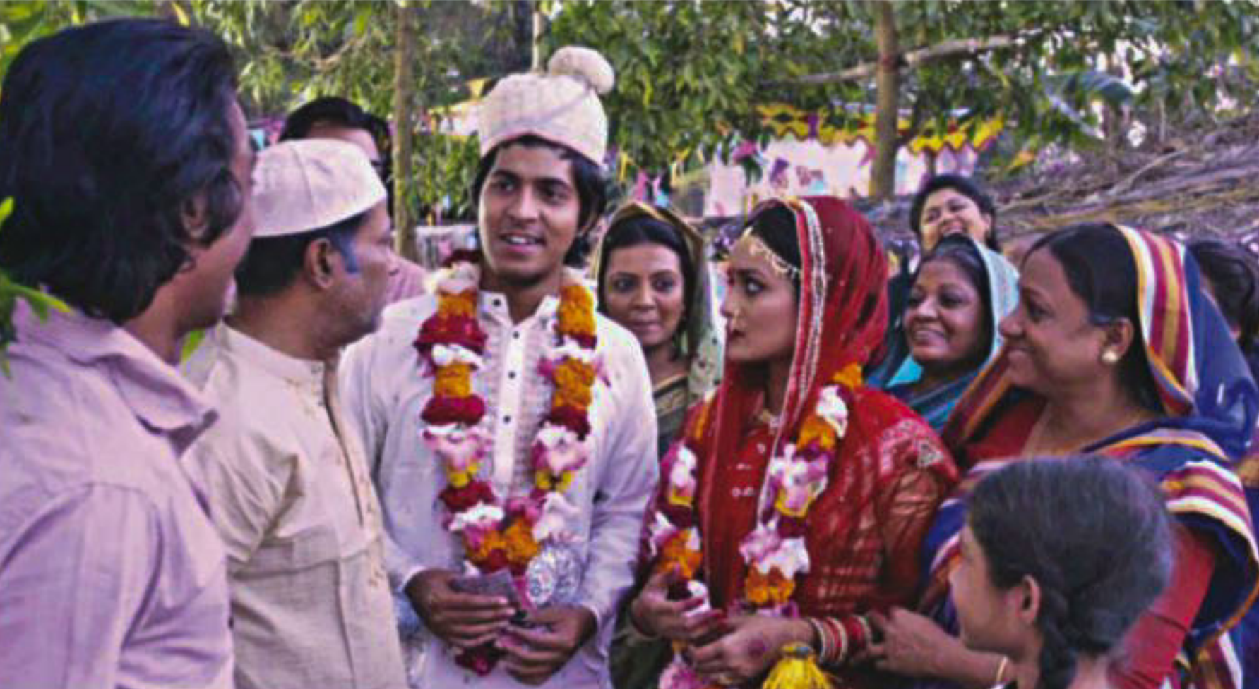
A scene from "Ujan Ganger Naiya".