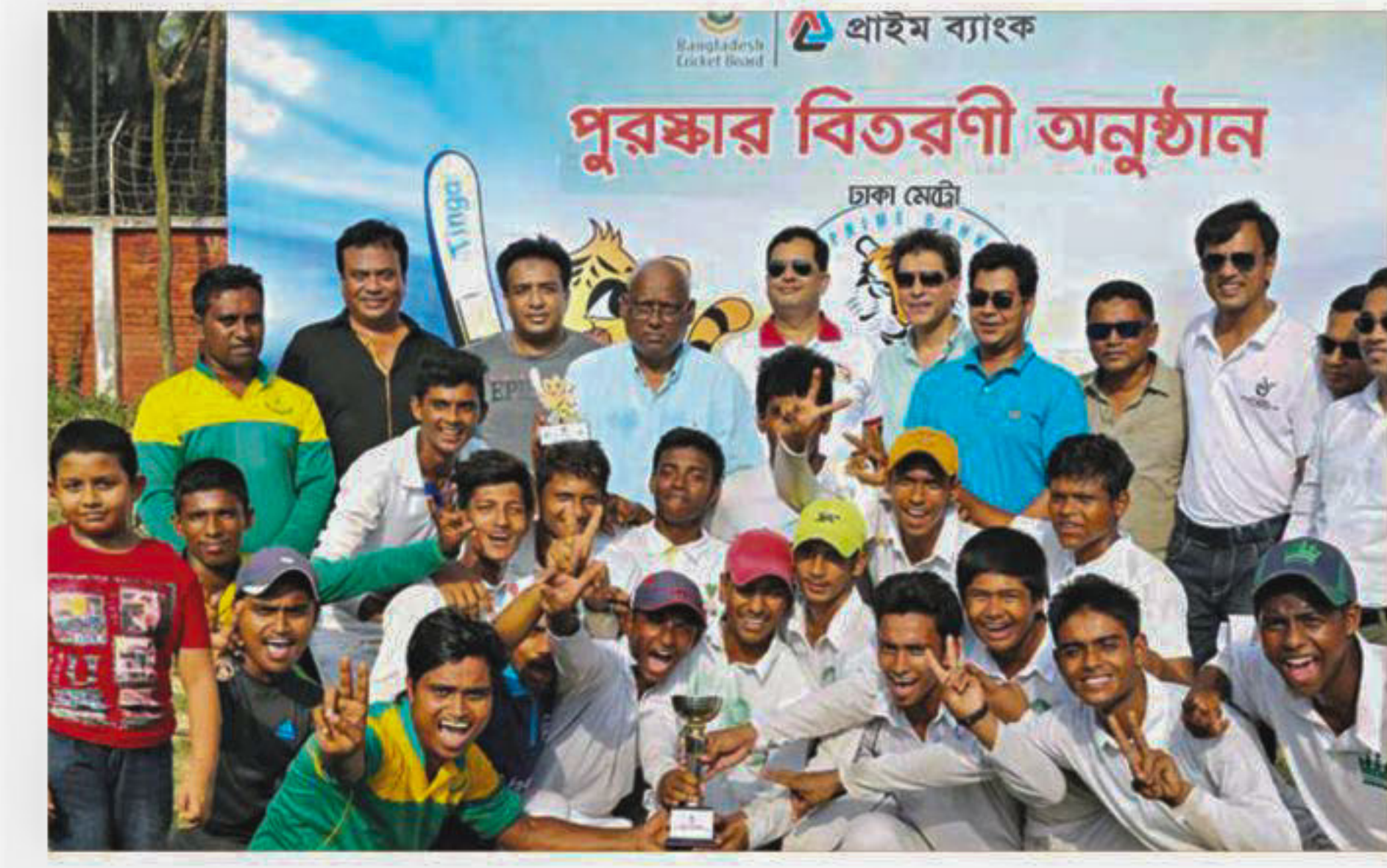
Players and officials of the Shamsul Hoque Khan School & College celebrate after winning the Dhaka Metro title of the Prime Bank Young Tigers National School Cricket Tournament at Dhaka University on Saturday.

AFP, Paris Ten-man Paris Saint-Germain beat Lille 2-1 in the French League Cup final at the Stade de France on Saturday to remain on course for a domestic clean sweep of titles. The Ligue 1 champions took the lead five minutes before half-time in contentious circumstances, with Javier Pastore's shot passing through the legs of an offside Layvin Kurzawa on its way into the net. But Lille hit back shortly after the restart when Djibril Sidibe fired a free-kick into the net. The capital city side were dealt a huge blow when Adrien Rabiot was shown a second yellow card with 20 minutes remaining. But a moment of madness from Lille goalkeeper Vincent Enyeama allowed Angel Di Maria to roll in the winner with 16 minutes to play for his 15th goal of the season. Laurent Blanc's men now have three trophies this term with a French Cup final against Marseille to come.