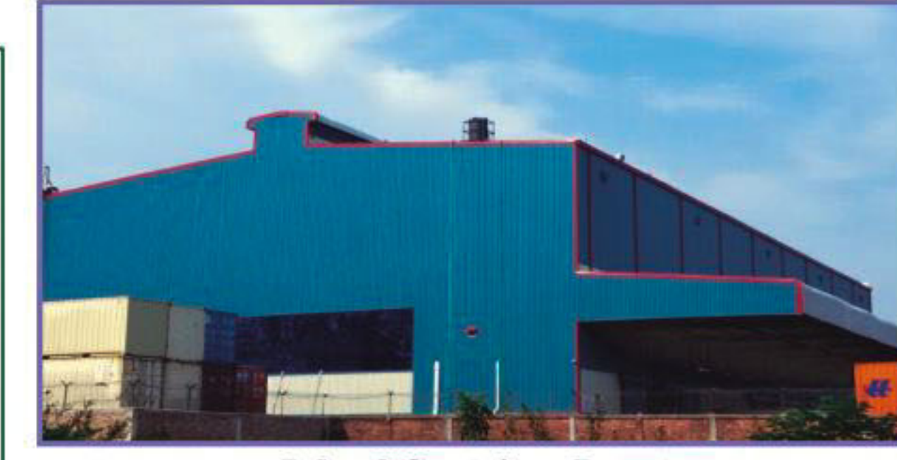
Inland Container Depot