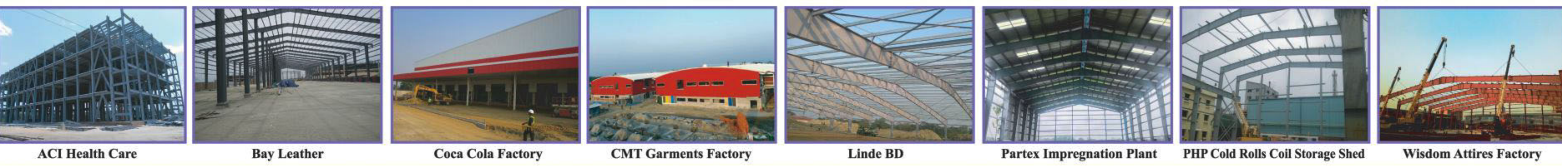
ACI Health Care Bay Leather Coca Cola Factory CMT Garments Factory Linde BD Partex Impregnation Plant PHP Cold Rolls Coil Storage Shed Wisdom Attires Factory