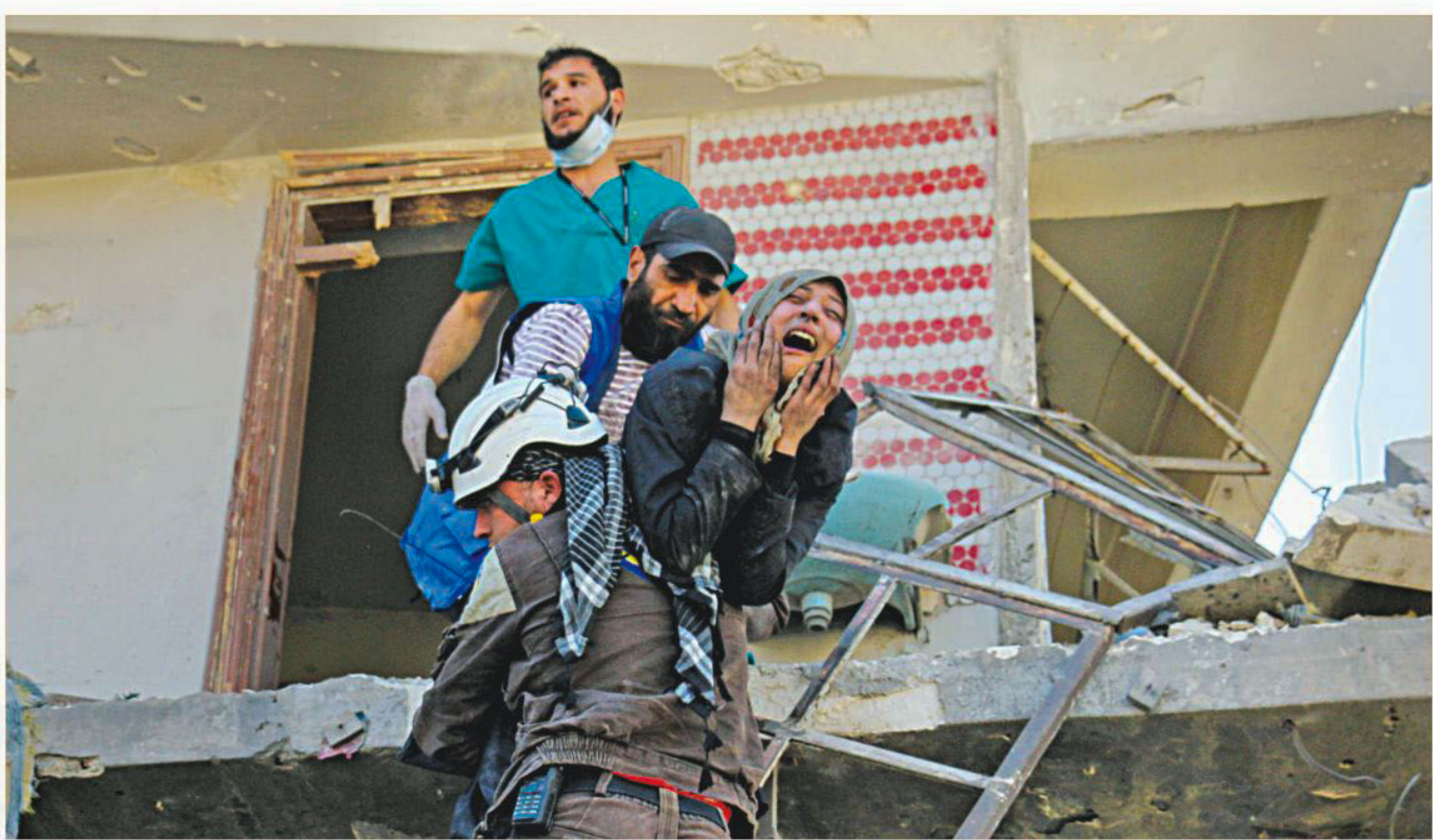
Syrian civil defence volunteers evacuate people from a damaged building following a reported airstrike in the rebel-held neighbourhood of Tareeq al-Bab in the northern city of Aleppo, yesterday. At least 27 civilians were killed yesterday in regime bombardment on rebel-held areas across Syria, including 12 in Aleppo. The airstrikes came a day after US President Barack Obama and the UN's special envoy warned that Syria's fragile ceasefire is in grave peril.