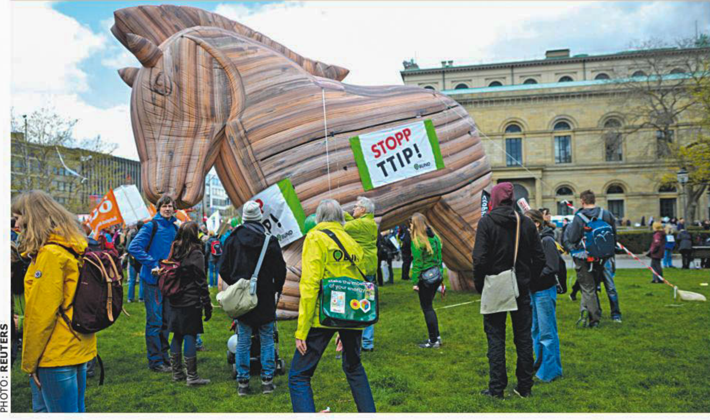
Protesters set up an inflatable 'Trojan Horse' as they demonstrate against Transatlantic Trade and Investment Partnership (TTIP) free trade agreement ahead of US President Barack Obama's visit in Hanover, Germany, yesterday.