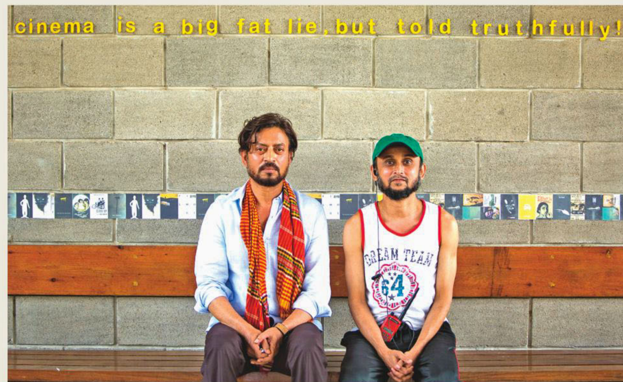
Irfan Khan with the director, Mostofa Sarwar Farooki

So how did your journey start with Mostofa Sarwar Farooki?