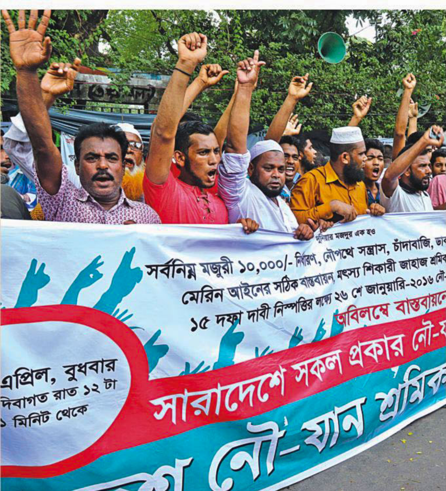
With a 15-point charter of demand, including fixing of the minimum wage for the workers at Tk 10,000, Bangladesh Water Transport Workers Federation forms a human chain in front of the capital's Jatiya Press Club yesterday.