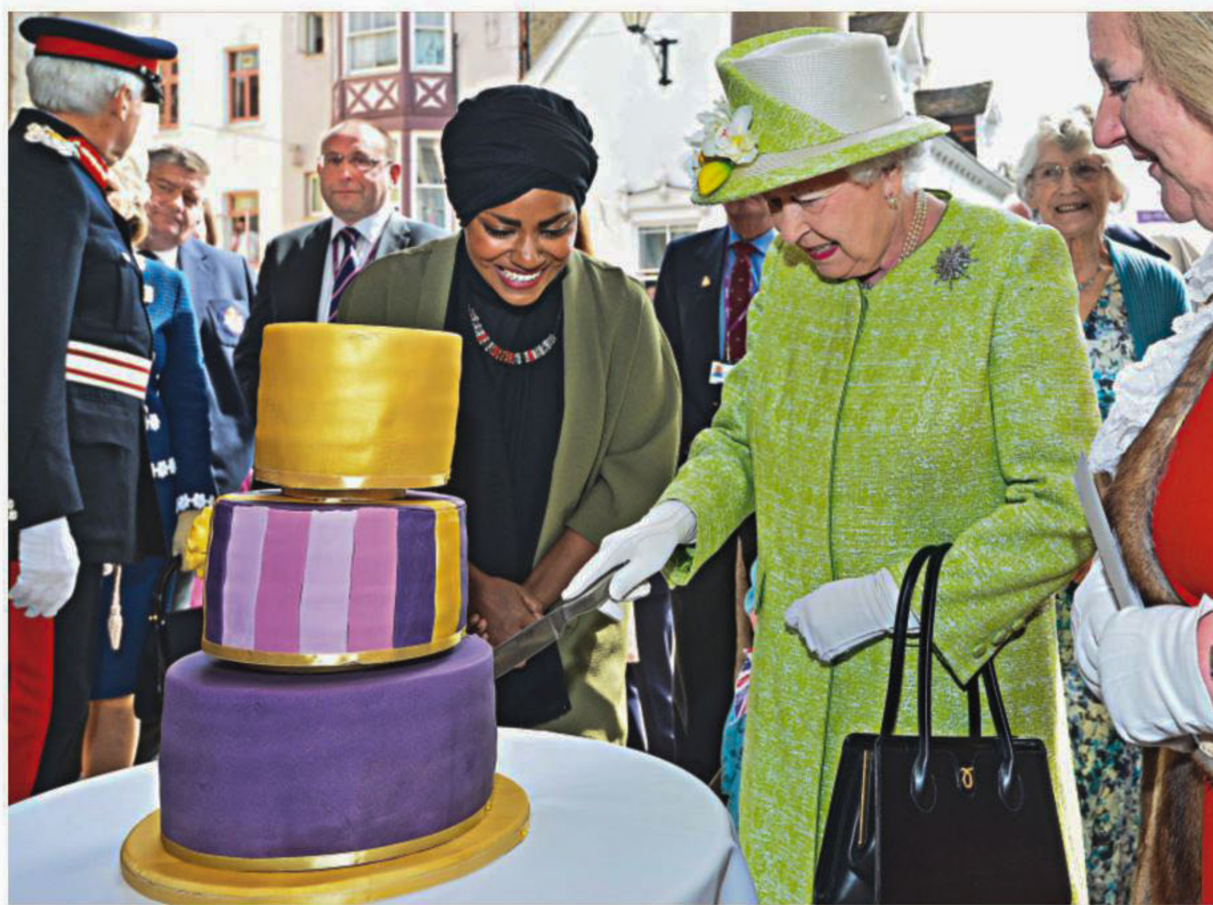
British national with Bangladeshi origin Nadiya Hussain watches as Queen Elizabeth cuts the cake Nadiya made for her on her 90th birthday yesterday.