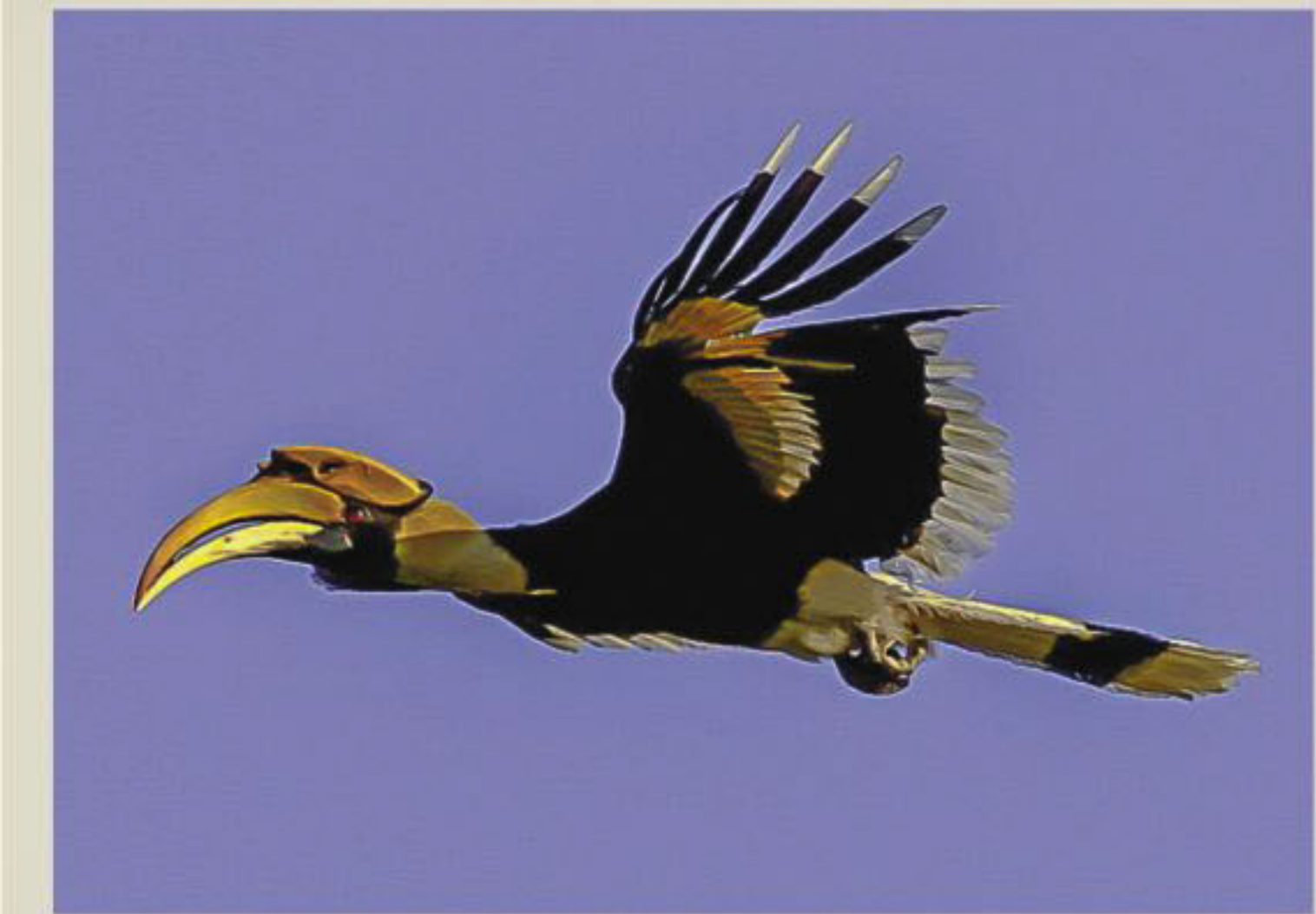
A Great Hornbill in flight.