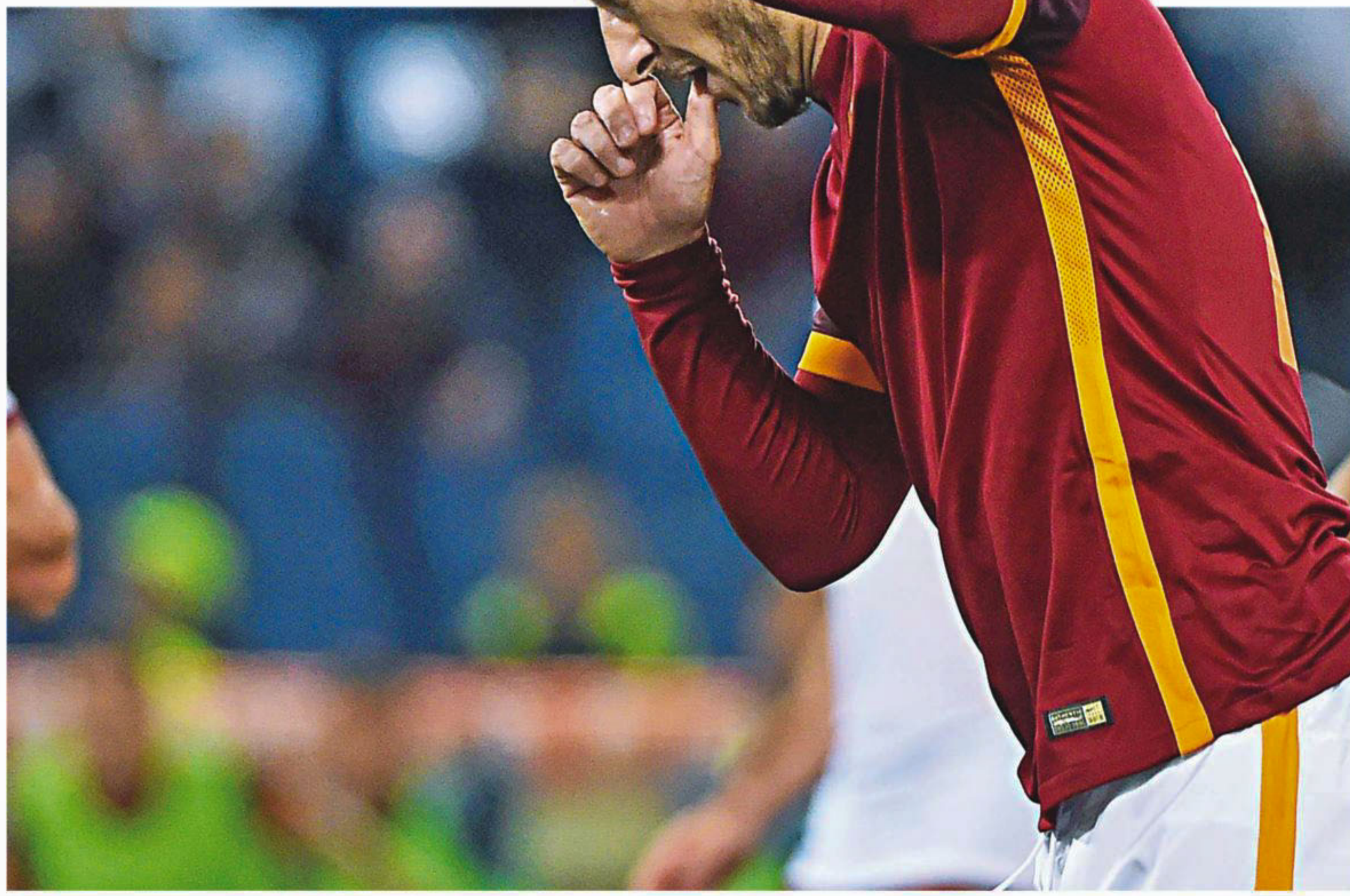
Roma star Francesco Totti celebrates his second goal against Torino during their Serie A encounter at Rome's Olympic Stadium on Wednesday.

The ageing captain was mobbed by the bench and fans were seen crying in the stands as Roma kept the pressure on to sit five points behind Napoli.