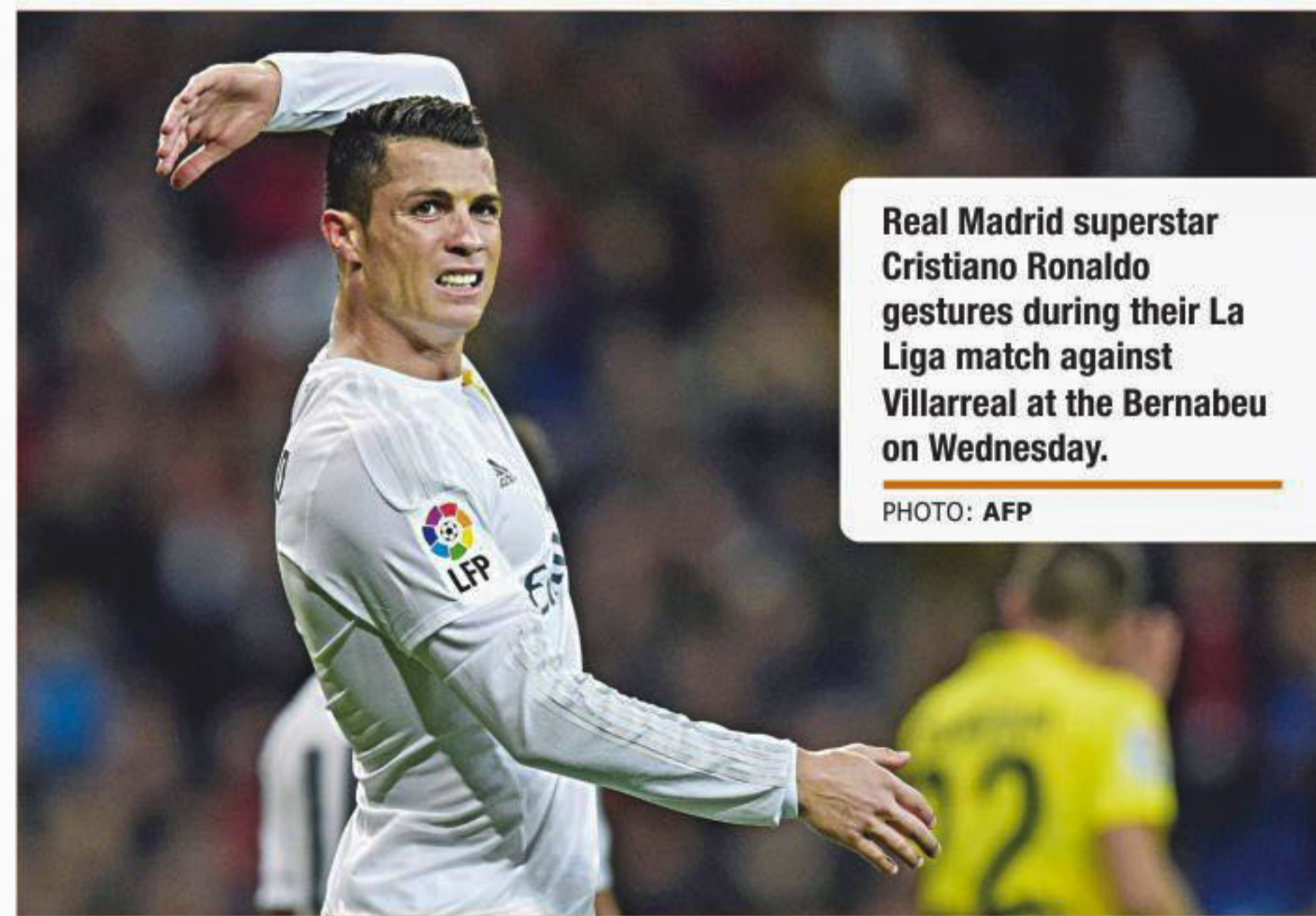
Real Madrid superstar Cristiano Ronaldo gestures during their La Liga match against Villarreal at the Bernabeu on Wednesday.

"I am calmer now than when I saw him leave the pitch," said Zidane.