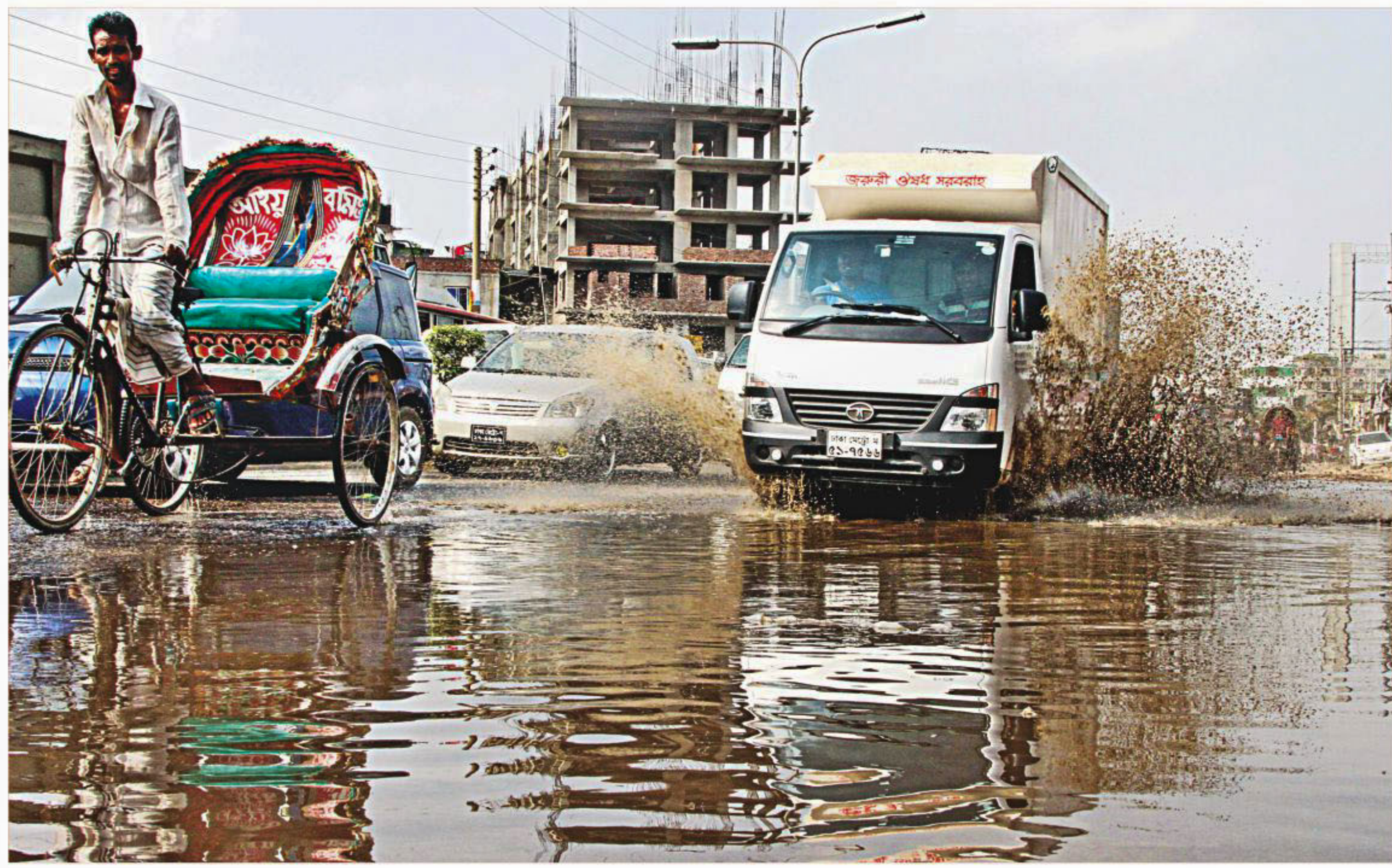
A road flooded with dirty and smelly water in front of the capital's Merul Badda Kacha Bazar area on Wednesday. It has been more than six months the road is waterlogged, and in a desperate need of removal of the water from its surface to provide a safe passage for all vehicles and pedestrians. Why the authorities concerned are turning a blind eye to this crisis is anybody's guess.

On March 20, 2015, the tribunal issued arrest warrants for the daily's Editor AMM Bahauddin and Special Correspondent Sakhawat Hossain taking cognisance of the charge sheet submitted on December 31.