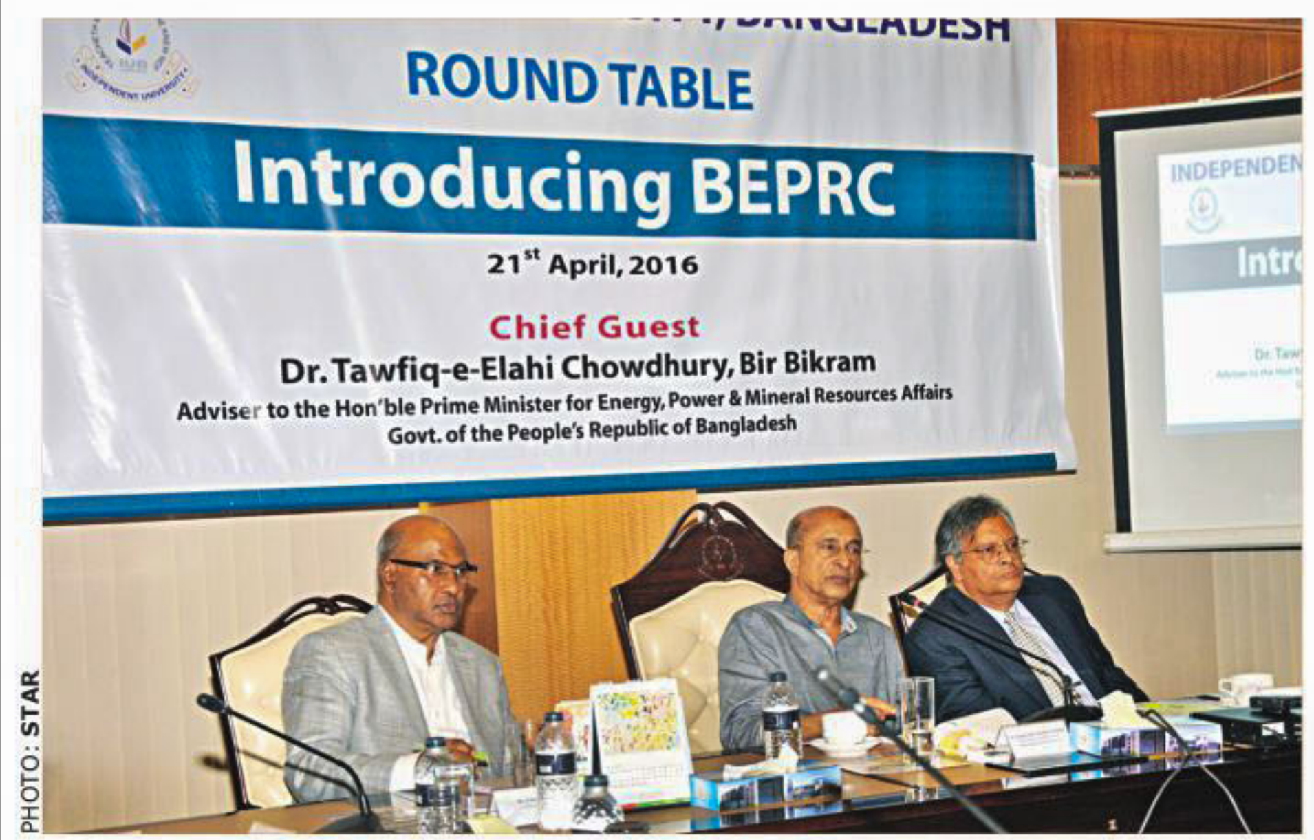
Dr Tawfiq-e-Elahi Chowdhury, centre, the prime minister's energy, power and mineral resources adviser, at the launching ceremony of Bangladesh Energy and Research Council at Independent University, Bangladesh in the capital's Bashundhara area yesterday.

Bangladesh Computer Council has been entrusted with the task of implementing the project by June 2018.