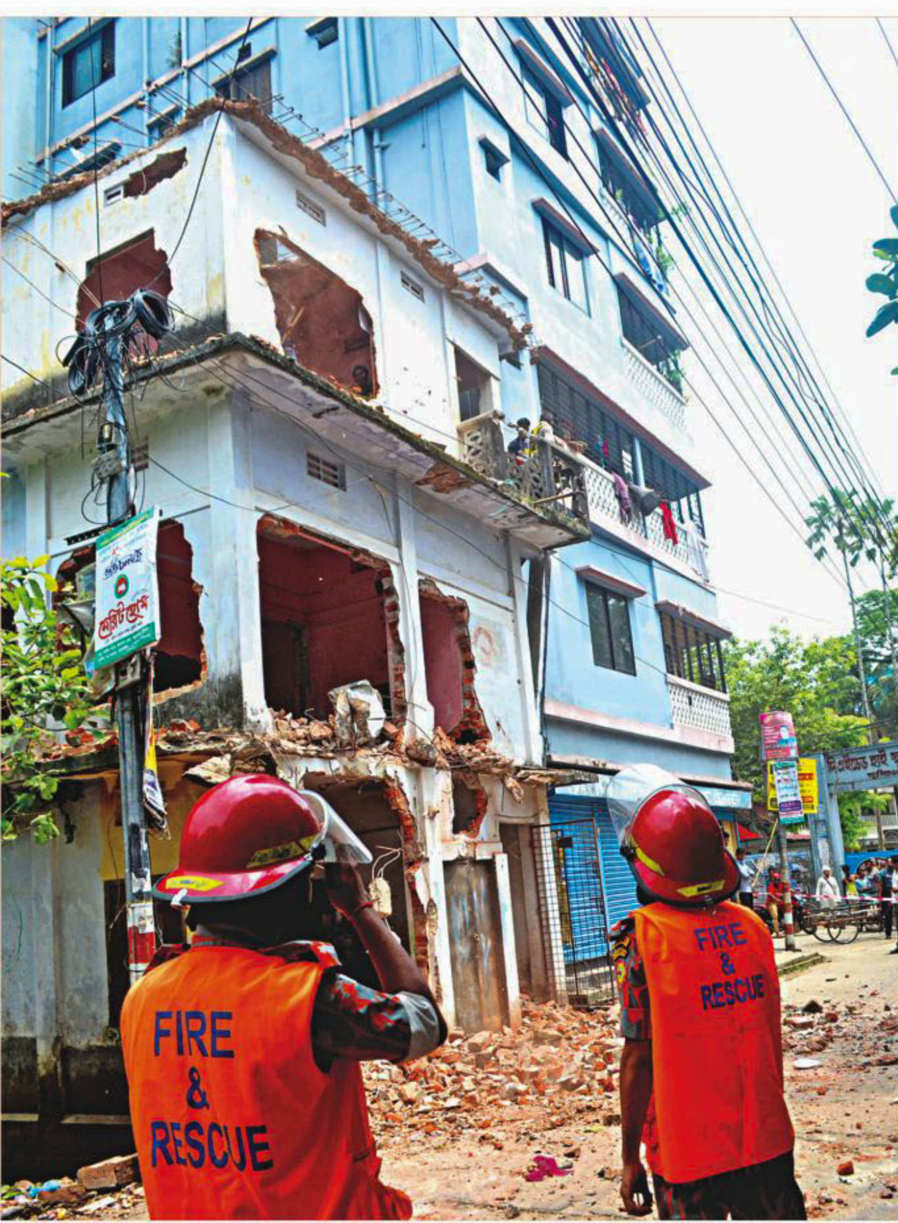
Sylhet City Corporation demolishes a three-storey residential building in Tantipara area of the city yesterday morning, one of 32 buildings listed as "risky" and vulnerable to earthquakes. The remaining buildings will also be knocked down by the corporation, as part of a drive to ensure safety of the citizens.