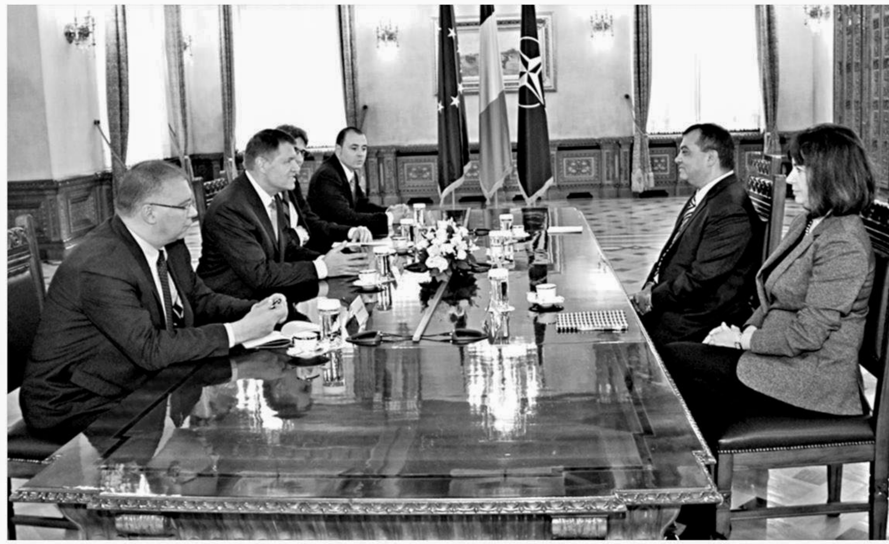
Inter-Parliamentary Union (IPU) President Saber Hossain Chowdhury in a meeting with Romanian President Klaus Werner Iohannis at Cotroceni Palace, Bucharest on Wednesday. Other than committing to deeper engagement and cooperation between the Romanian parliament and the IPU, the two underscored the increasing importance of parliamentary diplomacy in responding to global challenges as well as the role of parliaments in implementing Agenda 2030.

Meanwhile, Sylhet Puja Udjapan Parishad and Bhairabatala Temple Committee yesterday formed a human chain in front of the temple, demanding that the government should impose strict rules to stop these kinds of activities.