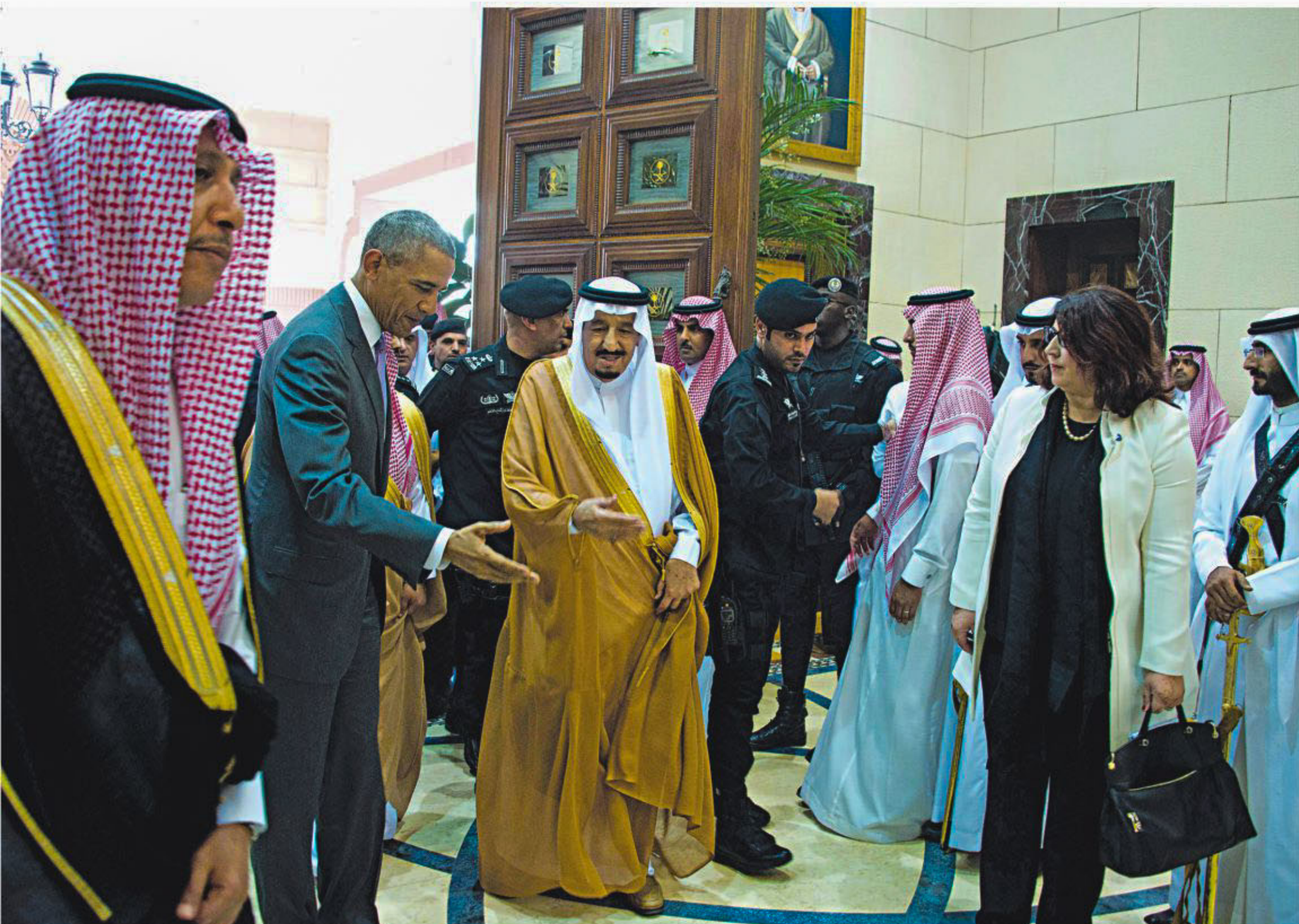
US President Barack Obama is greeted by King Salman bin Abdulaziz al-Saud of Saudi Arabia at Erga Palace in Riyadh yesterday. Obama arrived in Saudi Arabia for a two-day visit hoping to ease tensions with Riyadh and intensify the fight against jihadists.