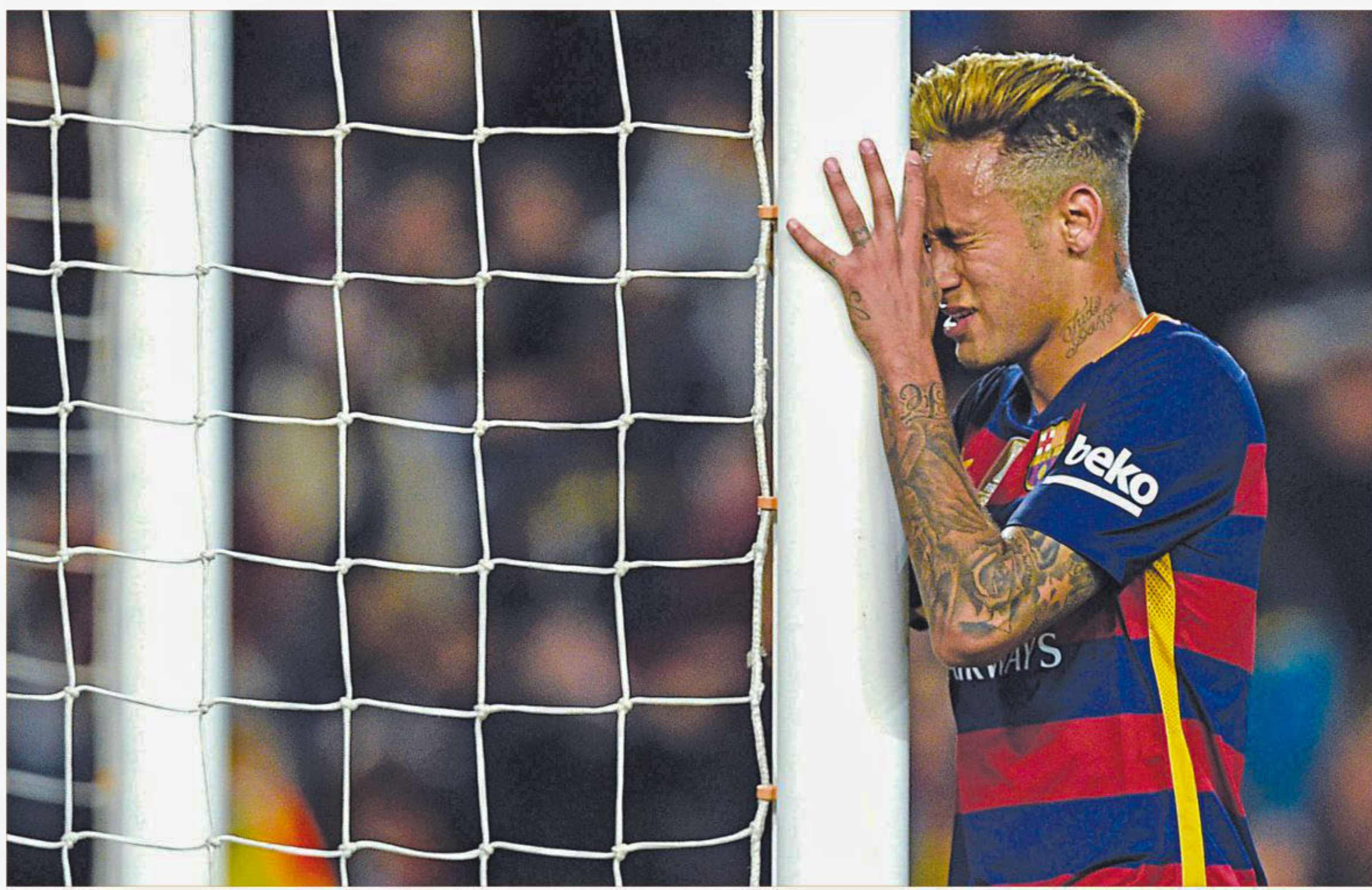
Barcelona forward Neymar puts his head against the post during their La Liga match against Valencia at the Nou Camp on Sunday. Barcelona lost the match 2-1 to complete their third consecutive defeat in La Liga.

"I am only interested in football. There is nothing more important for Barca fans than turning around this situation and we know the difficulty of the challenge, so I'm not interested in anything else."