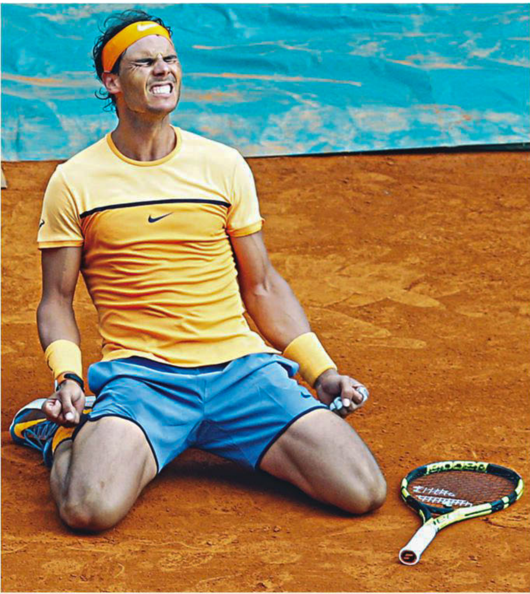
King of Clay Rafael Nadal of Spain lets out a cry of joy after ending a near two-year drought of Masters 1000 titles and clinching his ninth Monte Carlos Masters trophy by beating Frenchman Gael Monfils in the final in Monaco yesterday.