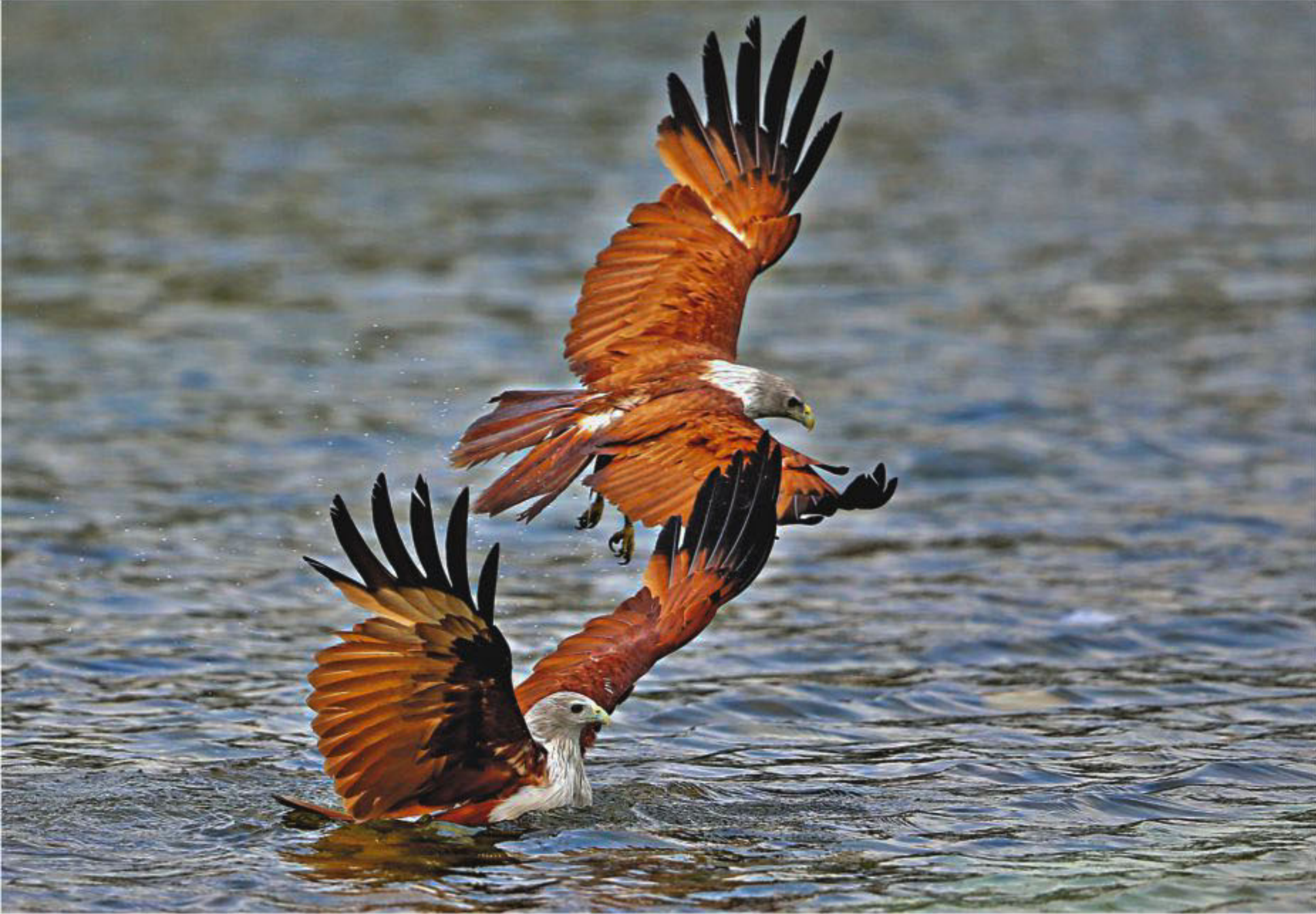
In the midday heat, two Brahminy kites play in the lake of Suhrawardy Udyan in the capital. The heat wave that is sweeping across the country continued yesterday with no respite in the capital. The photo was taken on Saturday.

The GrEAT BaCKING Putin 'personally assured' Assad that Russia won't let Syria lose civil war PAGE 8