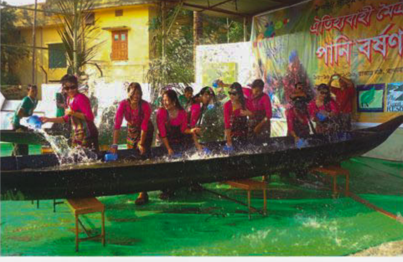
Kite festival in Manikganj (L) and water festival in Bandarban mark Pahela Baishakh celebration.