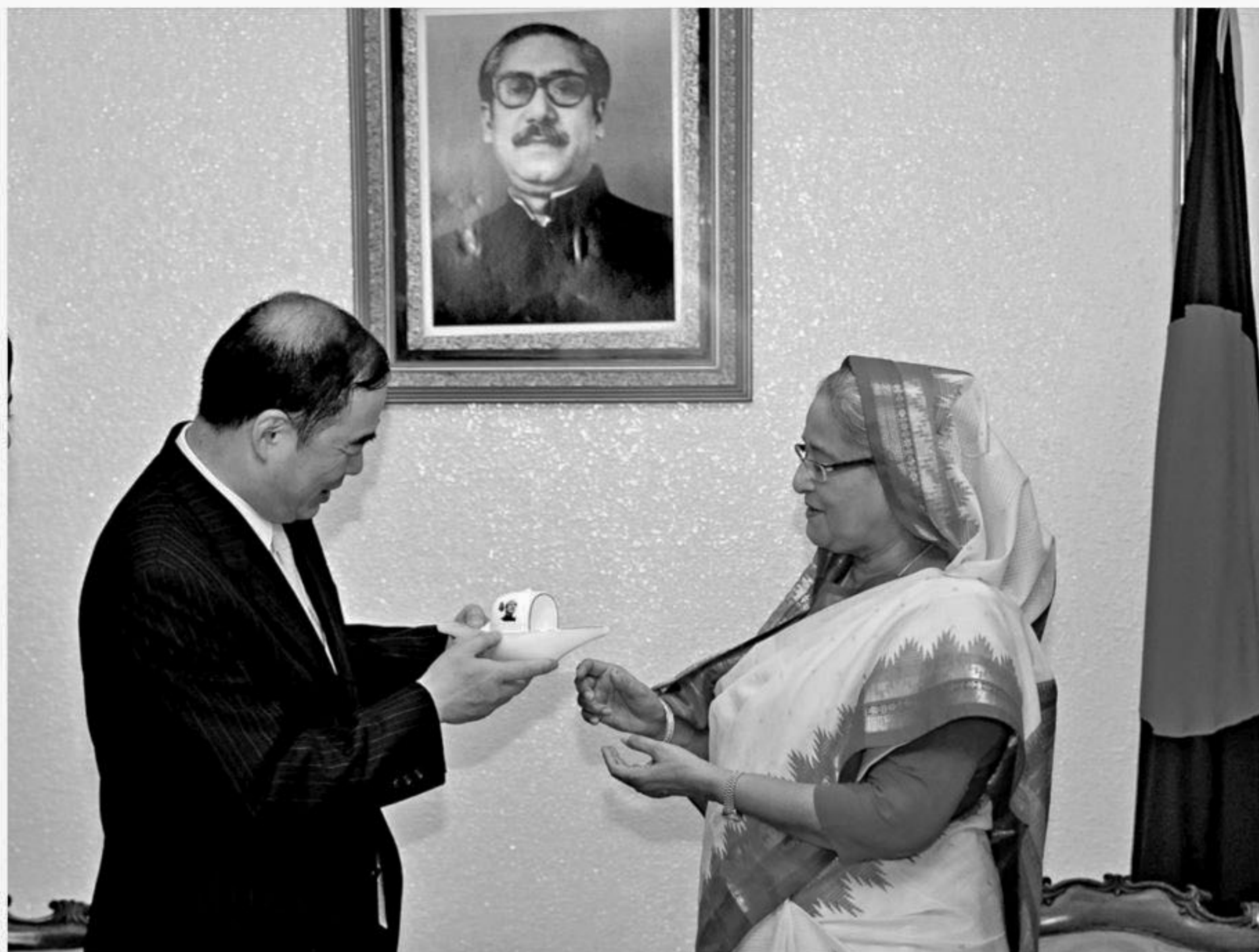
Kong Xuanyo, assistant minister for Chinese foreign affairs, receiving a gift -- a replica of boat -- from Prime Minister Sheikh Hasina after he called on her at her office in the capital yesterday.

"But when we realised that the suspicion was wrong, we let him go," he said.