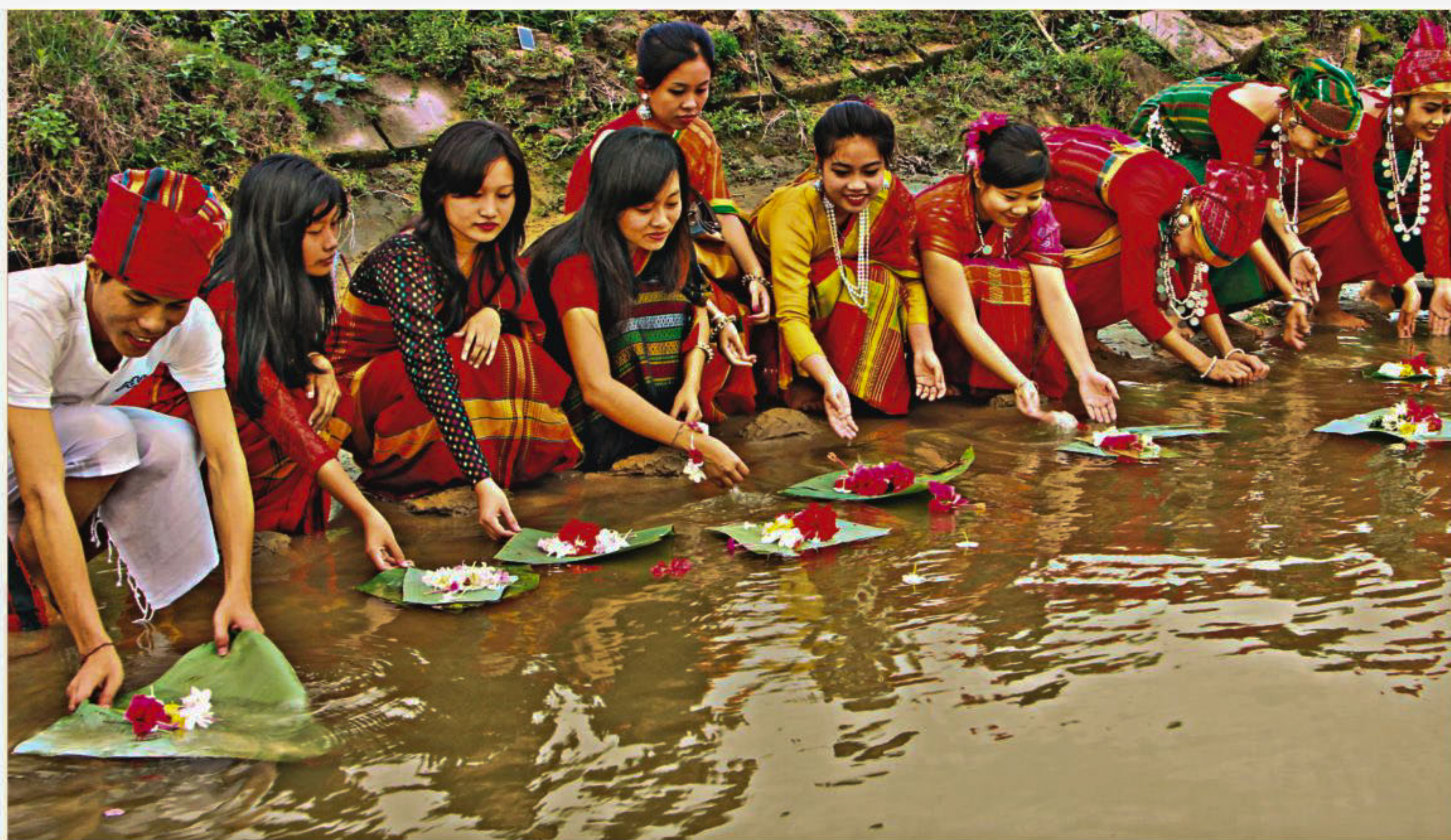
People of the Chakma community performing their traditional Phulbiju near Changhi Bridge in Khagrachhari yesterday. This is part of the biggest social festival Baisabi of the indigenous people of Chittagong Hill Tracts that celebrate the New Year.