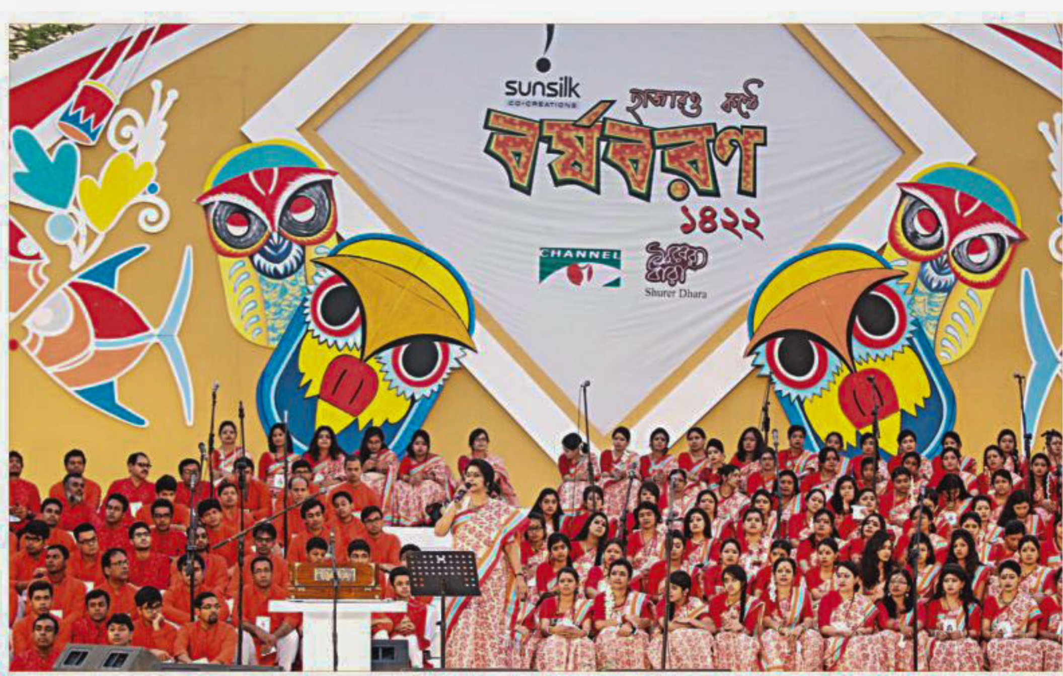
Like previous years, Shurer Dhara will celebrate their programmes to mark the New Year.

On April 14, Pitha Utsab (festival of traditional cakes) will take place at night at Madhyam para and Ujanipara in the town. On April 15 and 16, a cultural programme featuring 'Maitree Pani Barshan' or showering each other with be held at Puraton Razar Math at 4pm in the town. Besides, traditional sports like tachhi khela and boli khela (a form of wrestling) will be held. People of Mro community in Bandarban are also preparing to celebrate their traditional 'Sankran Poi' festival at Sakho para and remote Ruifu Mro para where thousands of Mro people gather every year to mark this special day. The traditional 'Flute Dance' of Mro indigenous community is notable, among the various programmes on this occasion. The Tanchangya and Chakma community people of Chittagong Hill Tracts also arrange their traditional 'Chila Khela' programme to celebrate this day. The three hill district councils, district administrations and various socio-cultural organisations will bring colourful rallies to mark the Boisabi festival. Although traditionally Boisabi is a cultural and religious festival of the indigenous people in Chittagong Hill Tracts; it is now enjoyed by the Bangalees as well.