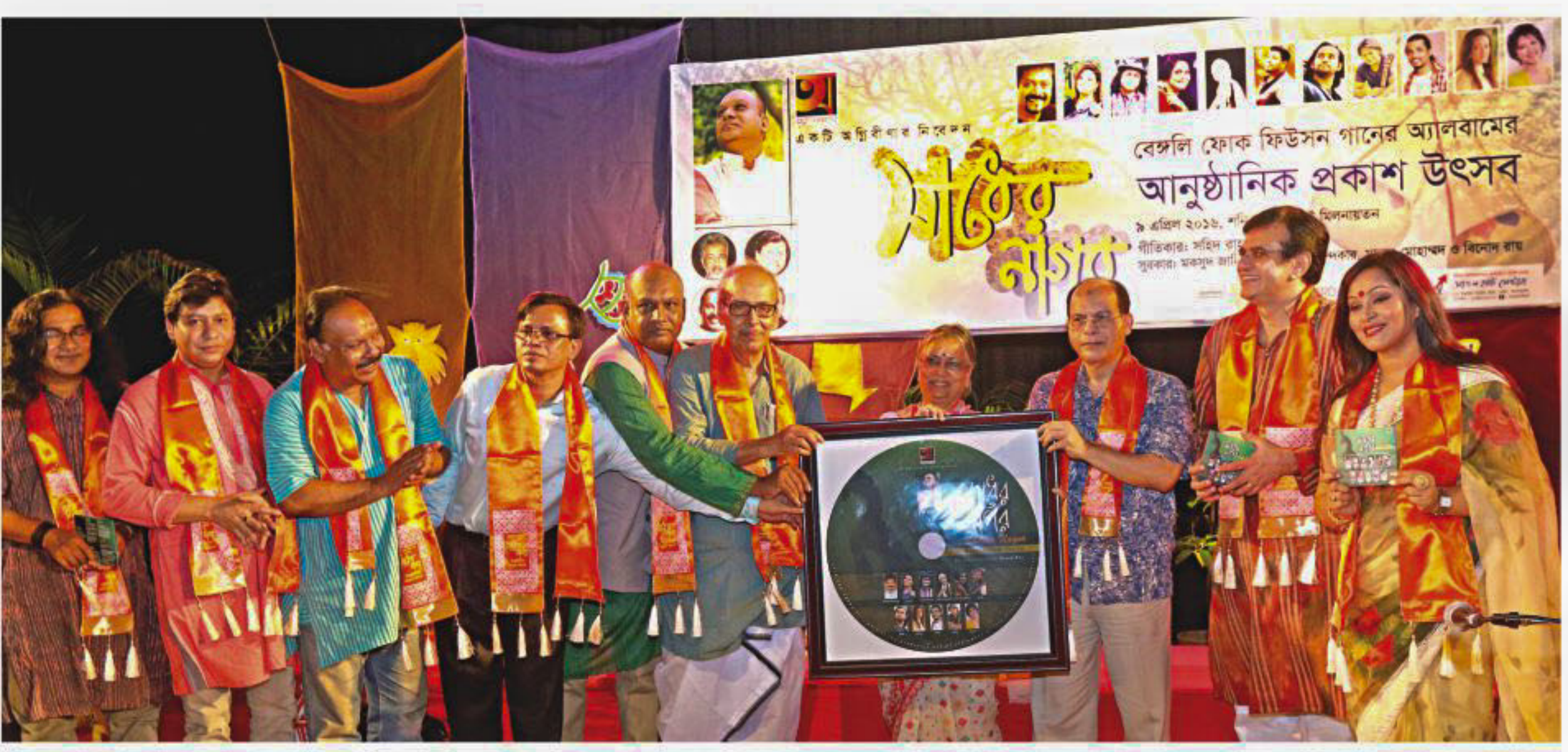
Guests launch the CD at the event.