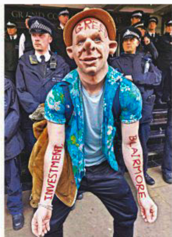
A protester in London.

"Don't blame Number 10 Downing Street or nameless advisers, blame me."