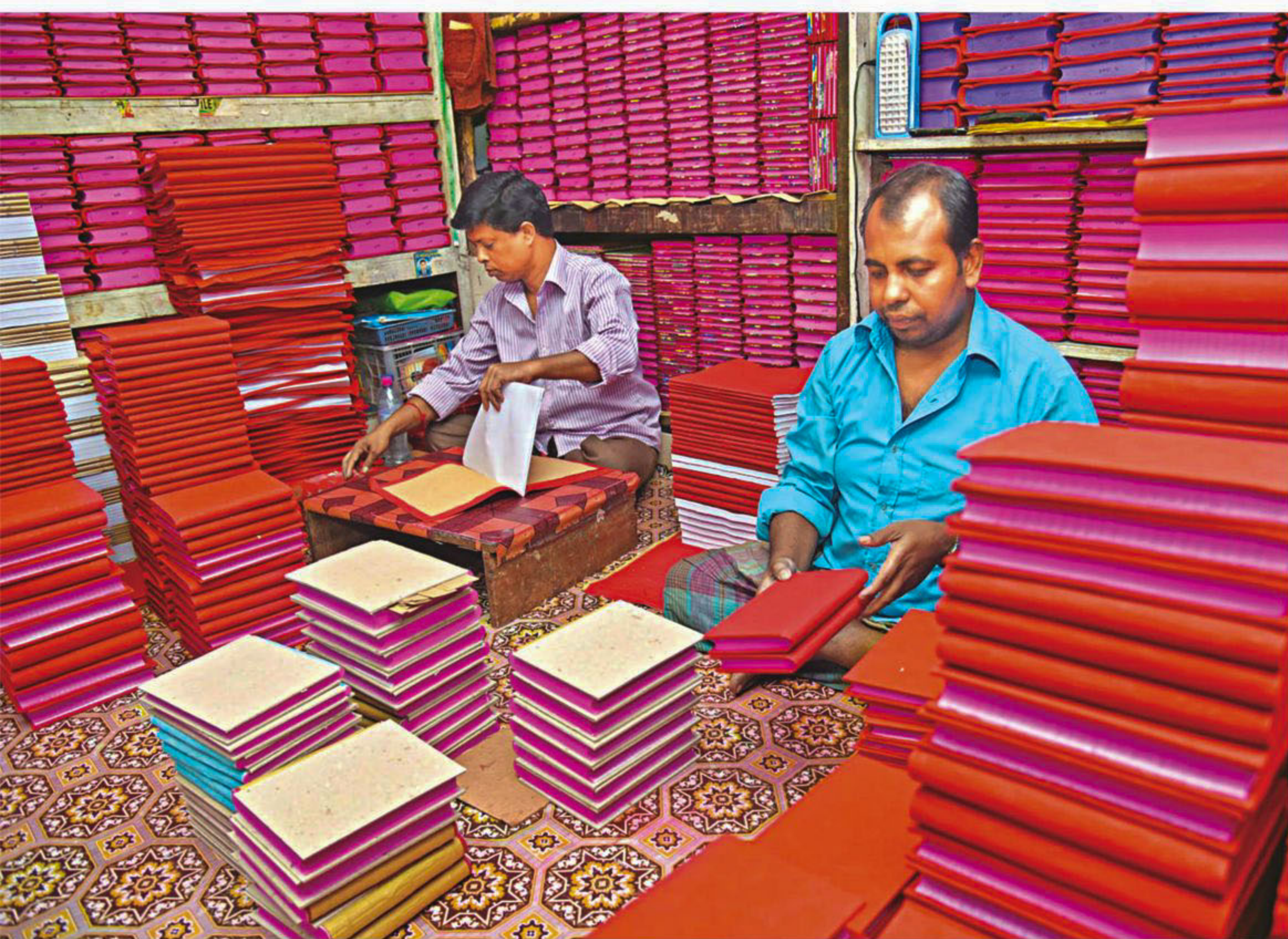
Piles of new ledgers at a shop in Andarkilla of Chittagong city yesterday. Traders close their old books at the end of the Bangla year and open a new one on Pahela Baishakh, which is on Thursday.