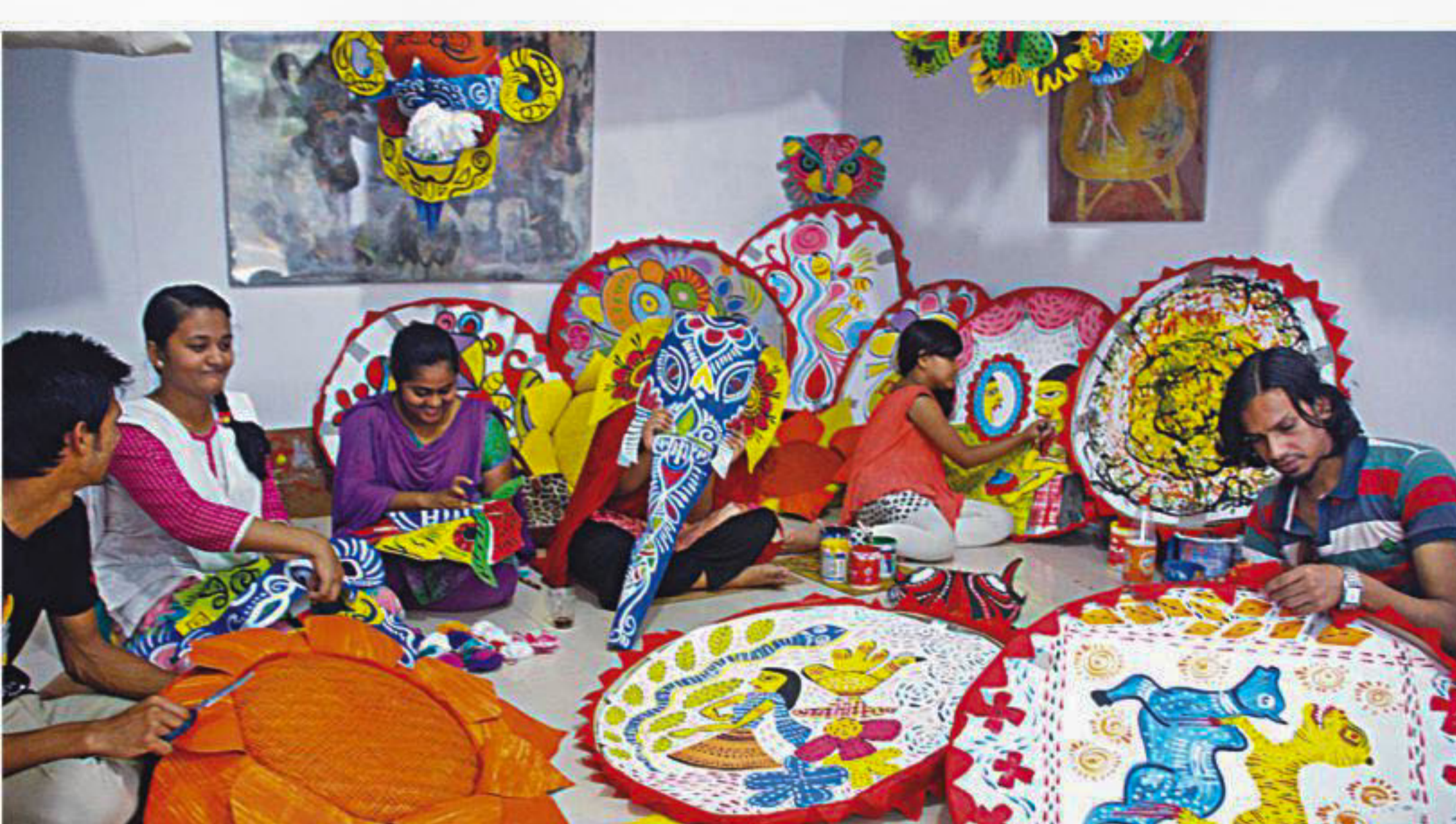
Students of Barisal Charukala busy in Mongol Shobhajatra preparations.