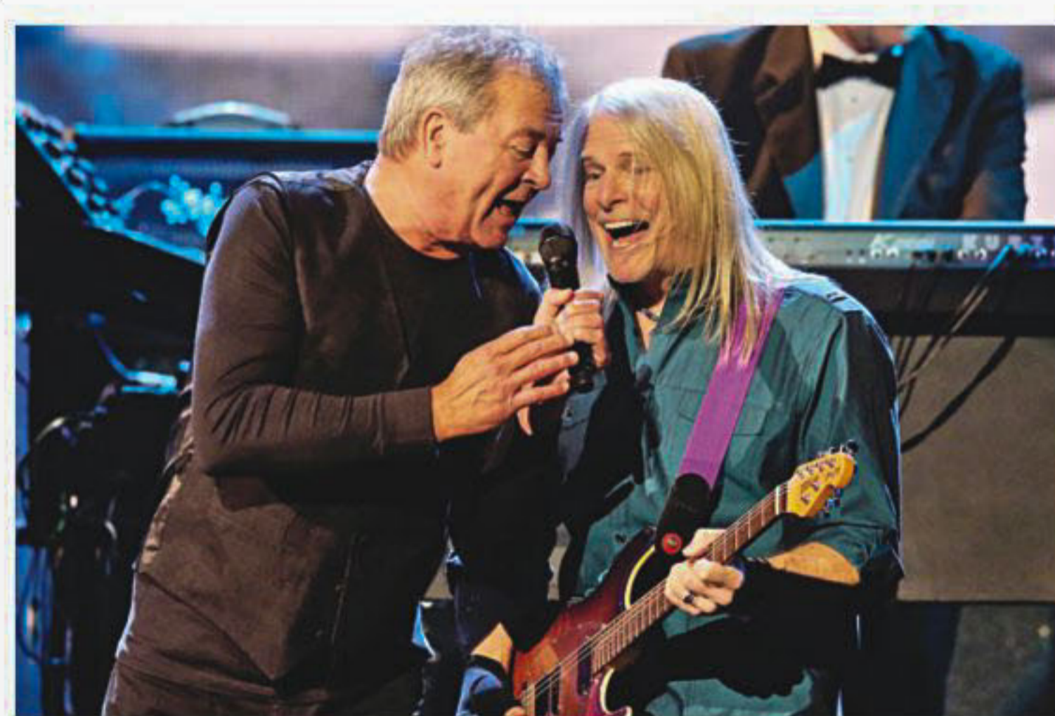
Ian Gillan and Steve Morse perform at the ceremony.

The Deep Purple lineup that frontman Ian Gillan calls the 'living, breathing Deep Purple' played a hit-filled set Friday night at the Rock and Roll Hall of Fame induction ceremony at Brooklyn's Barclays Center. The band, most of them dressed in suits, kicked things off with a searing rendition of "Highway Star", complete with its crushing organ-riffing and off-kilter guitar stabs, as Gillan lasciviously yowled about his dream woman and fantasy car and Don Airey nailed the song's gothic, ascending organ solo. Next they jammed a little instrumental "Green Onions" with an image of late keyboardist Jon Lord behind them, before Gillan returned to lead them in a funky take on "Hush" that saw guitarist Steve Morse joining in on its 'na-na-na' chorus. And then they ended with a fittingly crushing, resplendent rendition of "Smoke on the Water". Although Ritchie Blackmore was not onstage, Morse - guitarist for Deep Purple for over 20 years -