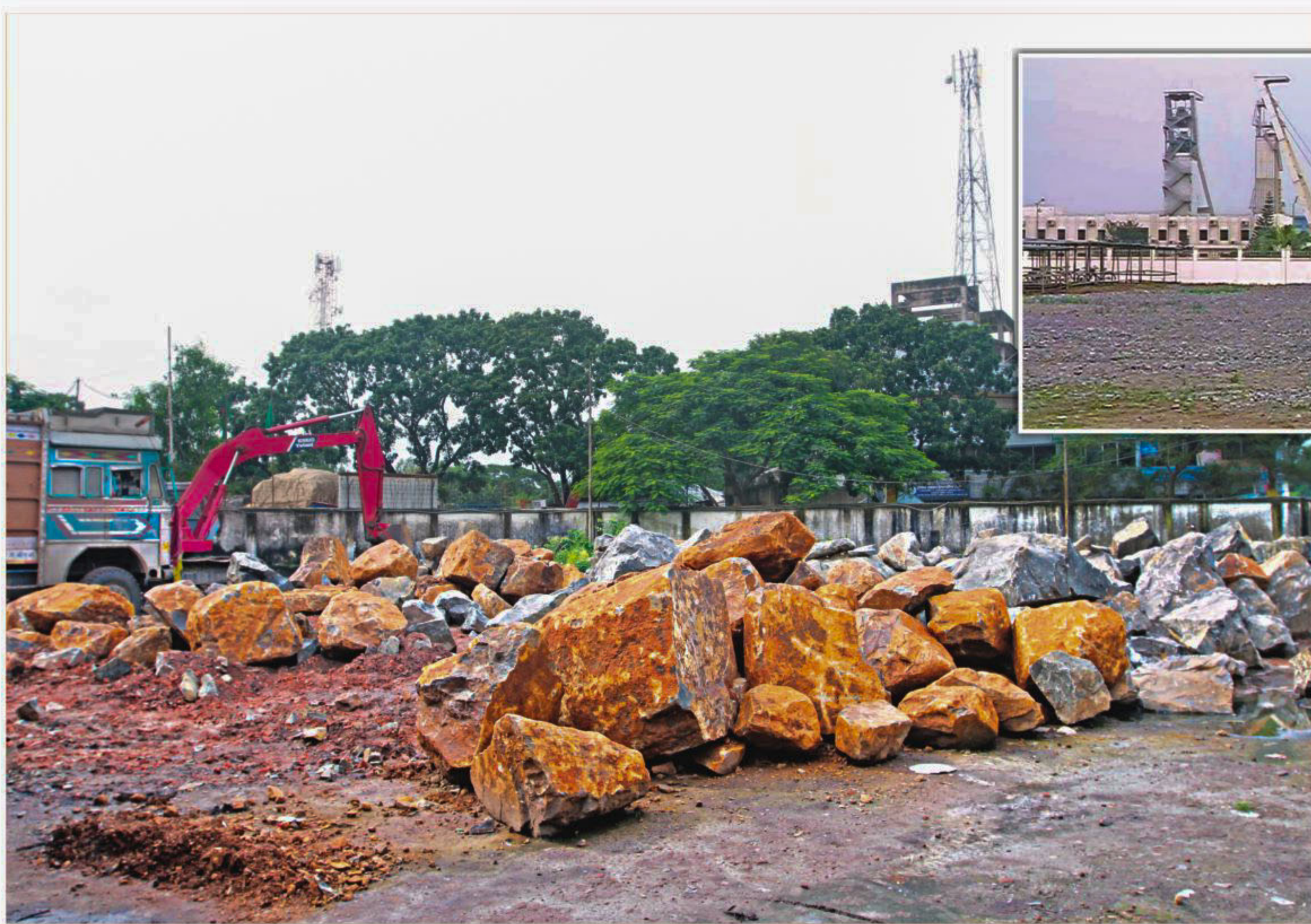
Left, rocks imported from India piled up at Hili Land Port in Dinajpur. Traders have to import rocks from India as production at the state-run Madhyapara Granite Mining Company Ltd, inset, remains suspended for over eight months. The photos were taken recently.