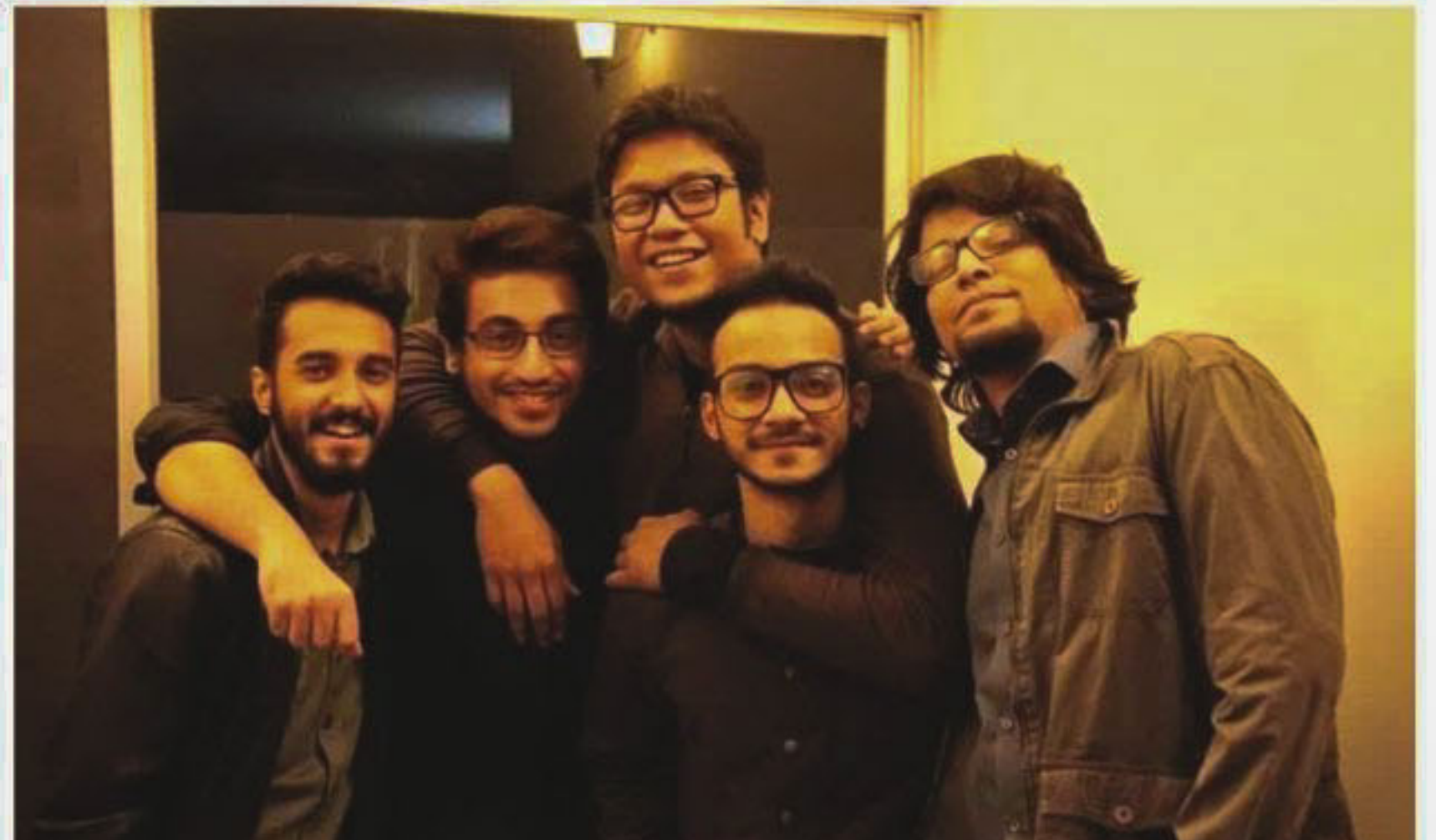
Nemesis will perform at the concert.

The concert will air live on Desh TV today from 4:30 to 11pm