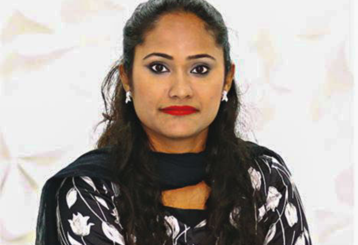
SHAH ALAM SHAZU

Ronty Das is a very popular singer today. She came under the spotlight after securing the fourth position in "Close Up 1" competition-2006. She talked about music and more in a recent conversation with The Daily Star.