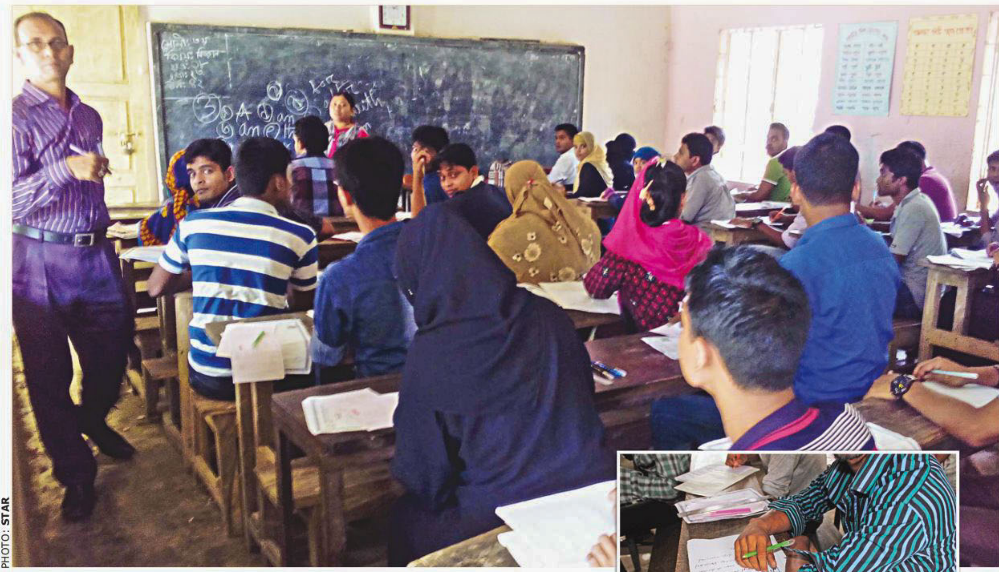
With answers written by a teacher on the blackboard in the exam hall, students take the English 2nd Paper exam at Adakhola High School in Rajapur of Jhalakathi yesterday. Inset, a student copying answers from a sheet. Although The Daily Star does not run photographs of exam halls, we are publishing the photos to expose this cheating.