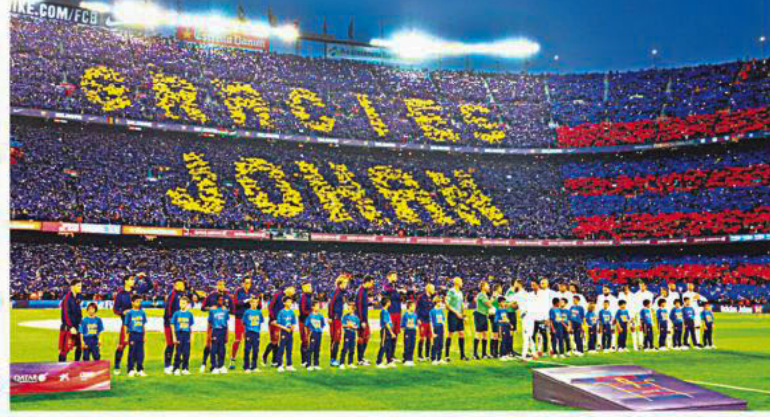
A 90,000 strong crowd at the Nou Camp showed their respect for recently-deceased Barcelona legend Johan Cruyff ahead of El Clasico on Saturday.

Despite defeat, Barca remain heavy favourites to win La Liga as they hold a six-point lead over Atletico Madrid with Real a further point back in third with seven games remaining.