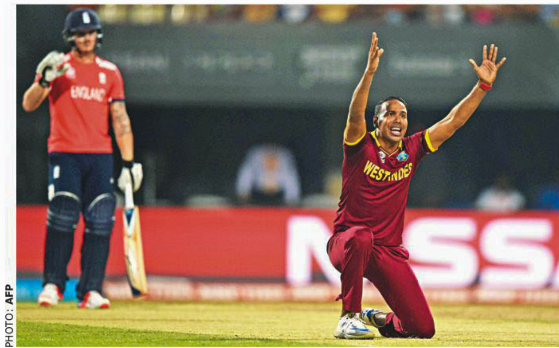
STAR ECONOMICAL BOWLER: West Indies spinner Samuel Badree provided breakthroughs against England in the World T20 final yesterday, recording figures of 2 for 16 in four overs.

"Today, I, Shahid Afridi, apologise to the whole nation for not being able to fulfil the hopes of myself and my team," he said.