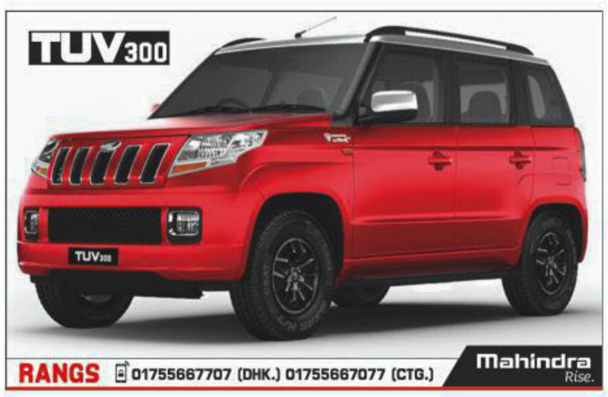
RANGS 01755667707 (DHK.) 01755667077 (CTG.) Mahindra Rise.

But on a night when the West Indian rhythm reached far and wide, Morgan saw beyond the gloom. "Personally I think we will have a lot more success in the future. This is just the beginning," he said. Morgan acknowledged that in this game his side had been "terrible" with the bat. "But you make what you can with what you have."