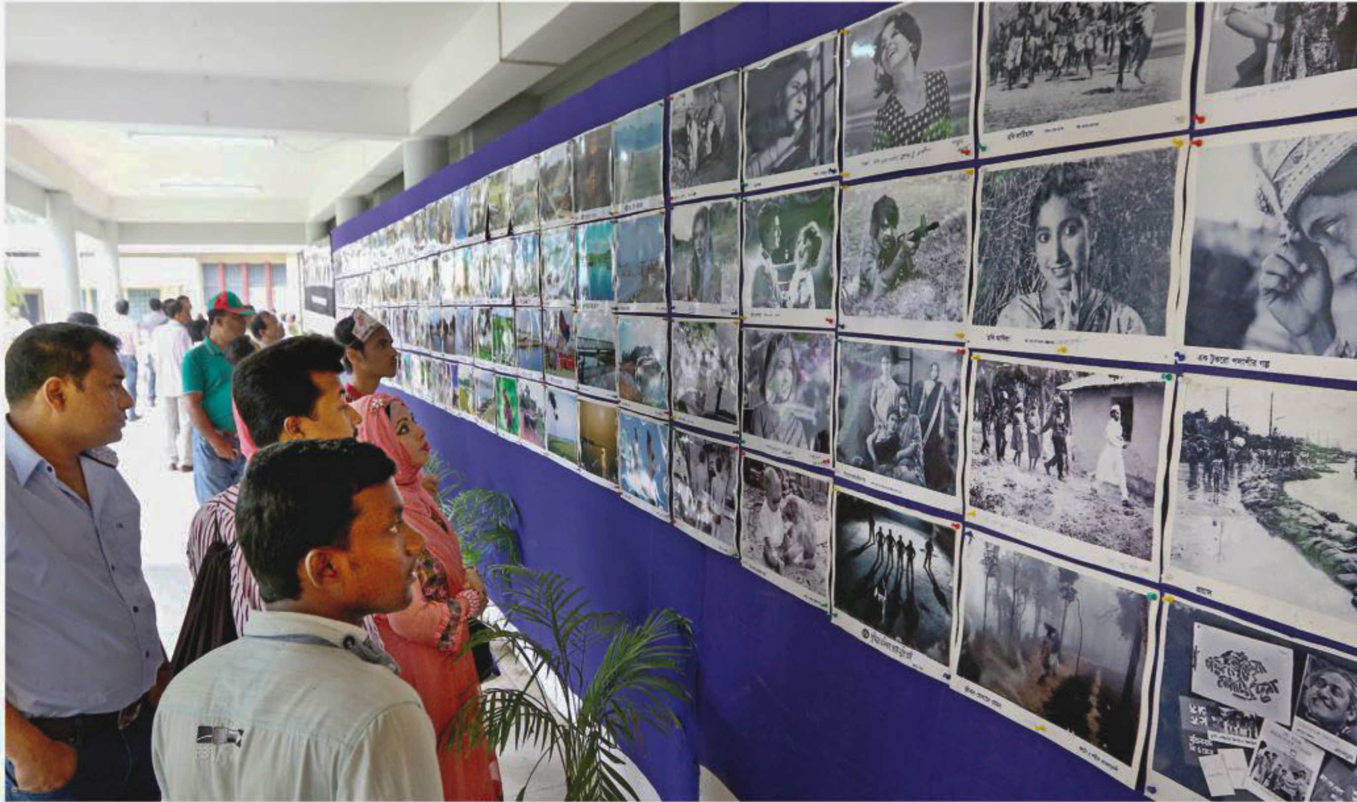
Attendees enjoy a throwback to the heyday of Bangla cinema.