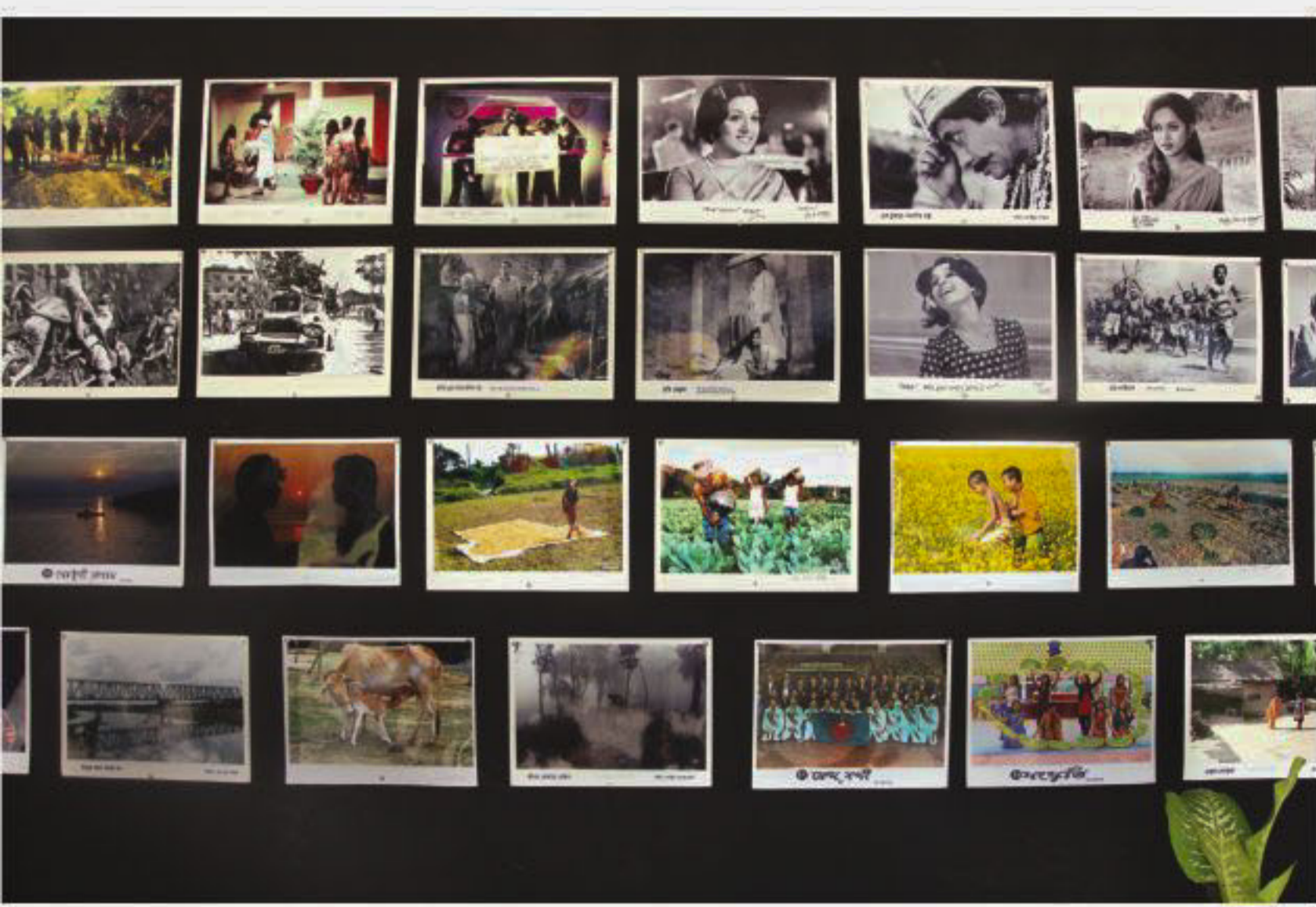
The photo exhibition has been a feature of Nat'l Film Day programmes.