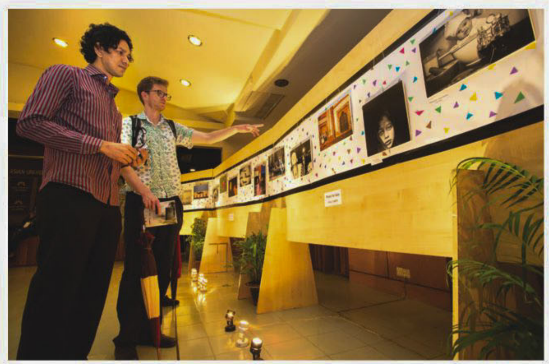
Visitors enjoy the exhibition.

happy," said Alamgir about his birthday plan. Alamgir, born on this day in 1950, stepped into the film industry with "Amar Janmohumi", and rose to fame through his second film "Dasshu Rani" where he acted alongside celebrated actress Shabana. Soon, Alamgir-Shabana became one of the most successful on-screen couples of Bangla films. Together they presented the audience with over 100 films, some of which were big hits at that time. Alamgir won his first National Film Awards in 1985 for his film "Ma O Chhele", and went on to win the National Award most times for a male actor.