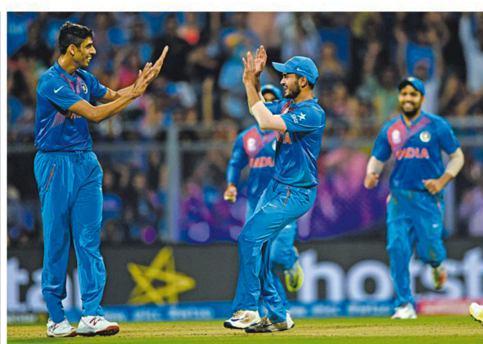
STAR ECONOMICAL BOWLER: India seamer Ashish Nehra was the only one among his teammates to keep the West Indian batsmen in check, conceding just 24 runs in his four overs and taking the wicket of Marlon Samuels.