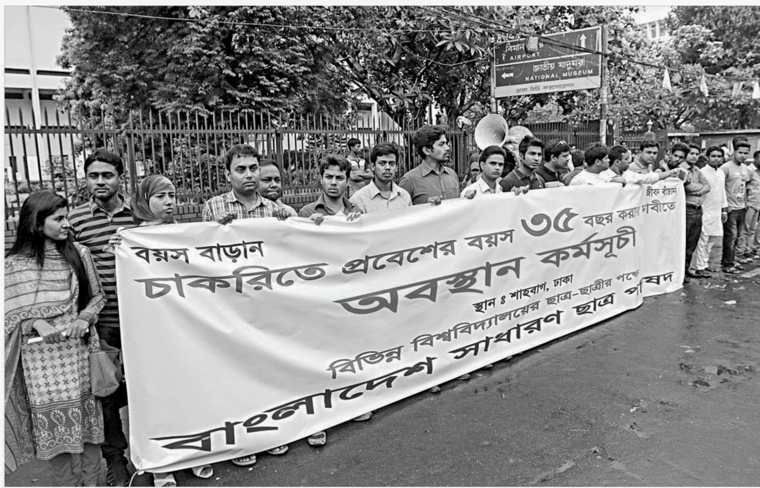
Bangladesh Sadharan Chhatra Parishad forms a human chain in front of Bangladesh National Museum at the capital's Shahbagh yesterday, demanding increasing of the age limit to 35 years for entering the government jobs.