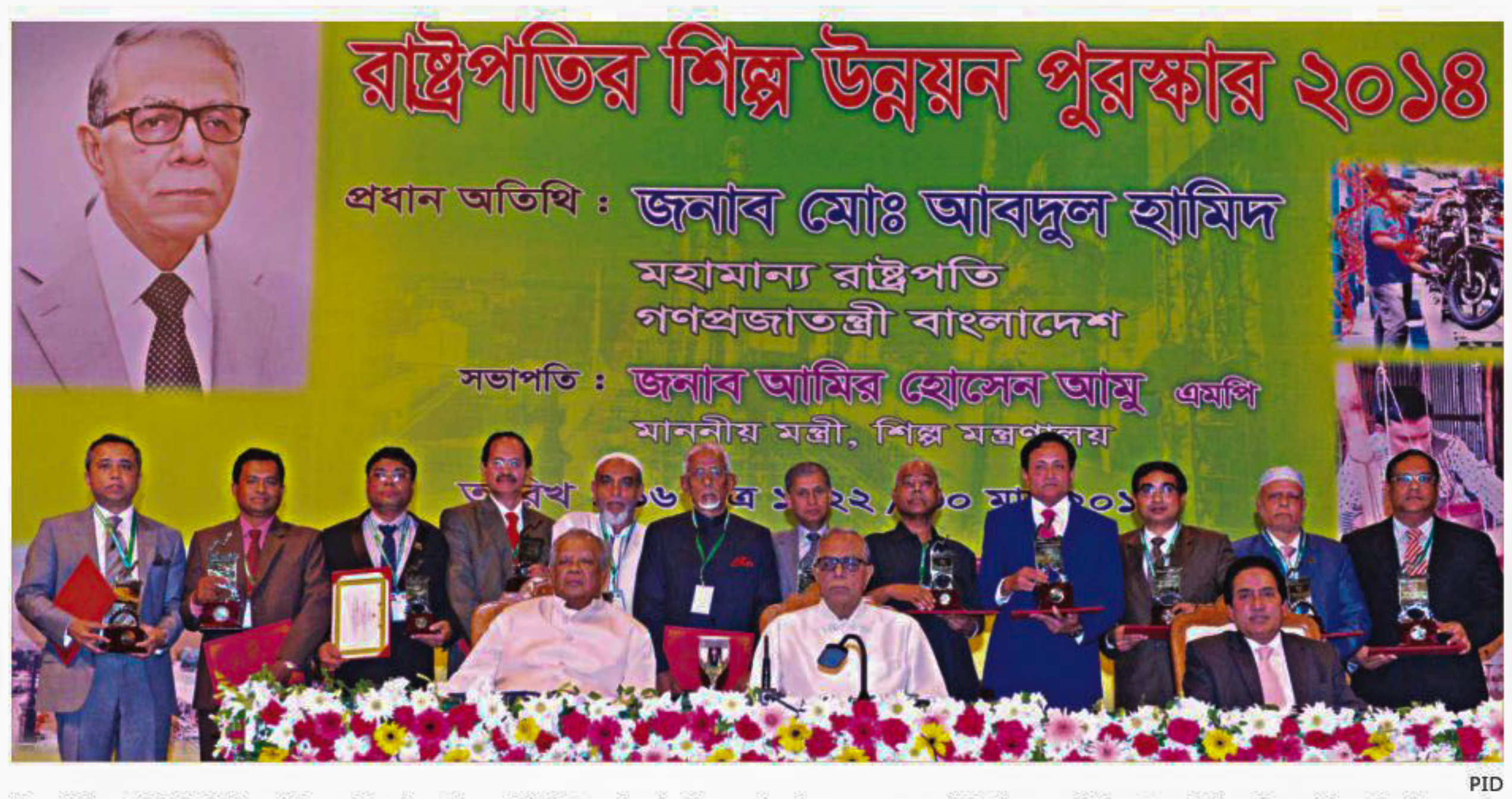
President Abdul Hamid and Industries Minister Amir Hossain Amu pose with the recipients of the President's Award for Industrial Development at a ceremony at Osmani Memorial Auditorium in Dhaka yesterday.

Bangladesh or REHAB. "If the tax is reduced to 3.5 percent on the transfer of used flats, it will create jobs for many. Revenue collection will also rise." Bhuiyan made the appeal while placing the revenue proposals for fiscal 2016-17 before the National Board of Revenue. Used flats are currently transferred in line with the property's value fixed by the government. No depreciation of value is allowed, even when the apartments are old, he said. The rate remains the same even if ownership changes 100 times, according to Bhuiyan.