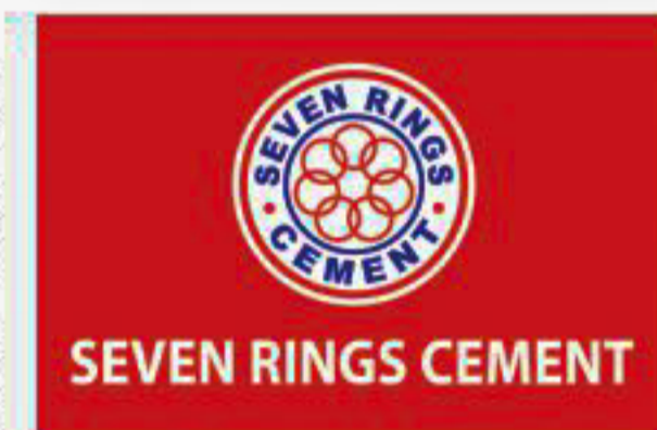
SEVEN RINGS CEMENT