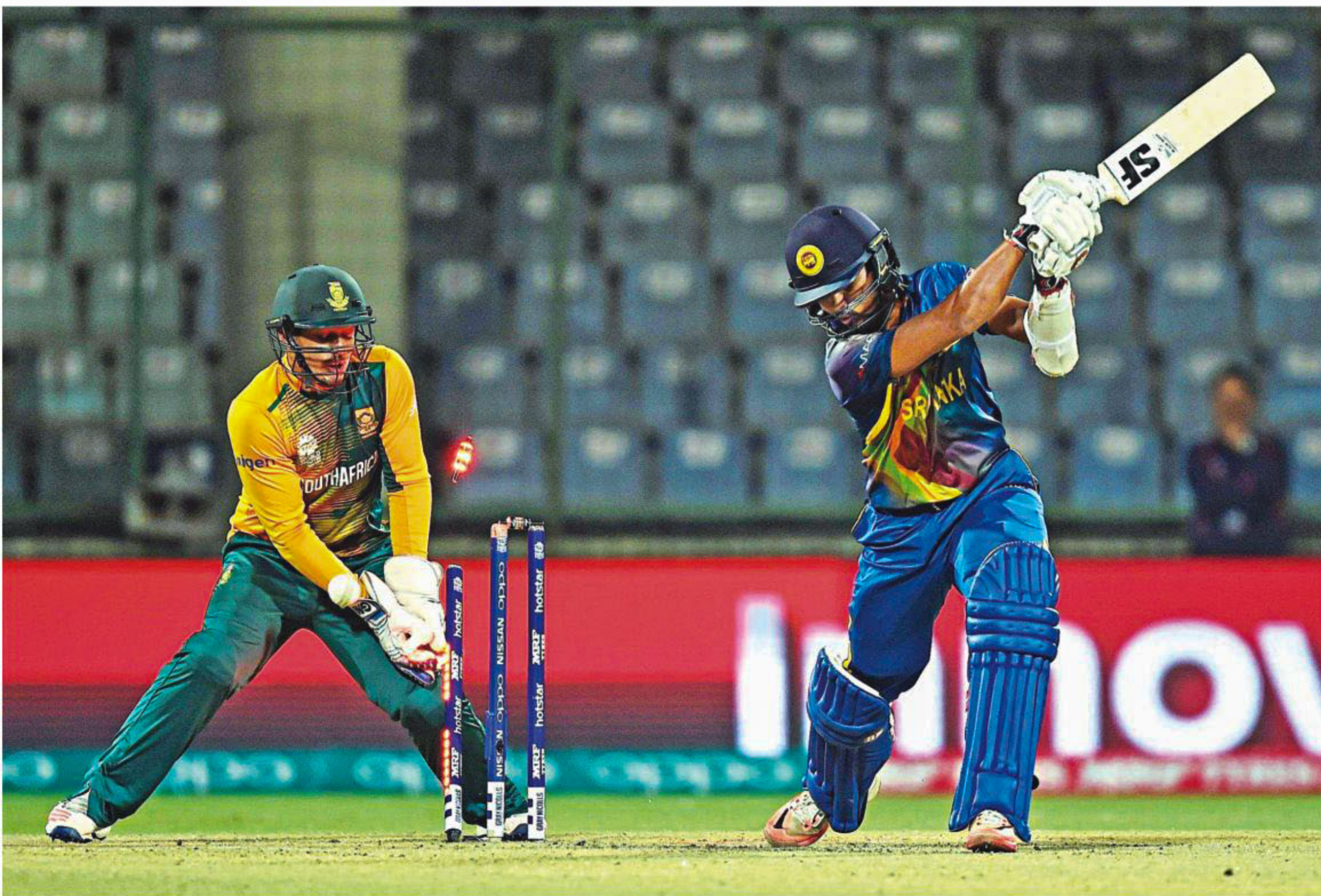
Sri Lanka opener Dinesh Chandimal's wild swipe against South Africa's Aaron Phangiso meets nothing but air while the ball disturbs his off stump during their World Twenty20 Super 10 match at the Feroz Shah Kotla Stadium in New Delhi yesterday.