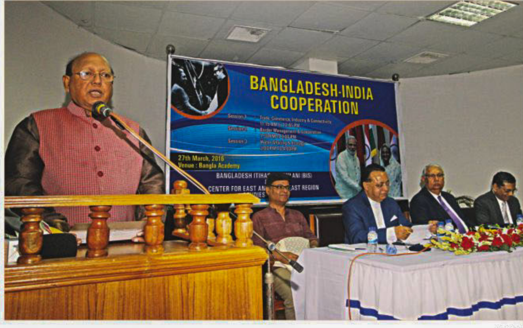
Commerce Minister Tofail Ahmed speaks at a discussion on cooperation between Bangladesh and India, at Bangla Academy in Dhaka yesterday.