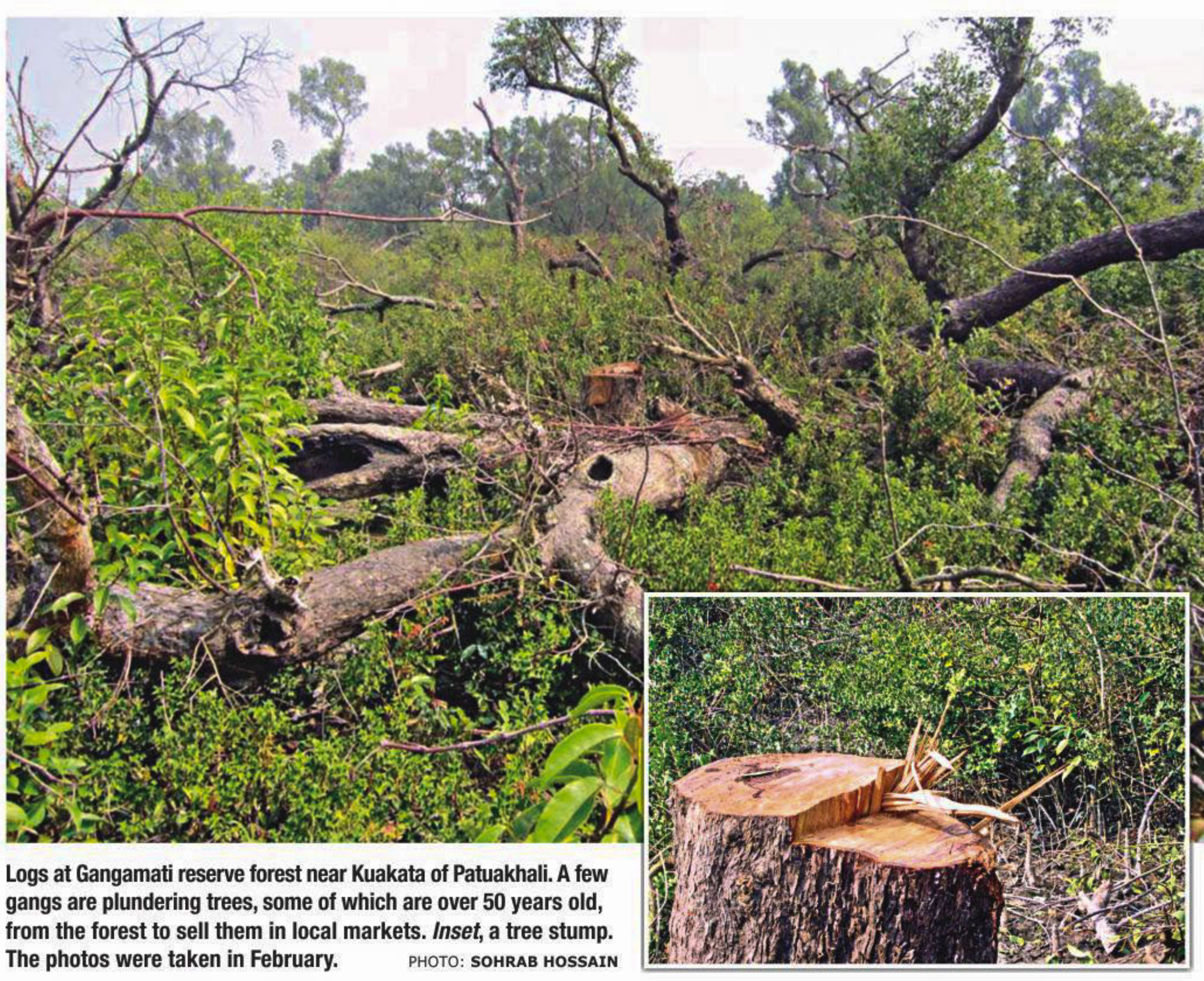
Logs at Gangamati reserve forest near Kuakata of Patuakhali. A few gangs are plundering trees, some of which are over 50 years old, from the forest to sell them in local markets. Inset, a tree stump. The photos were taken in February.