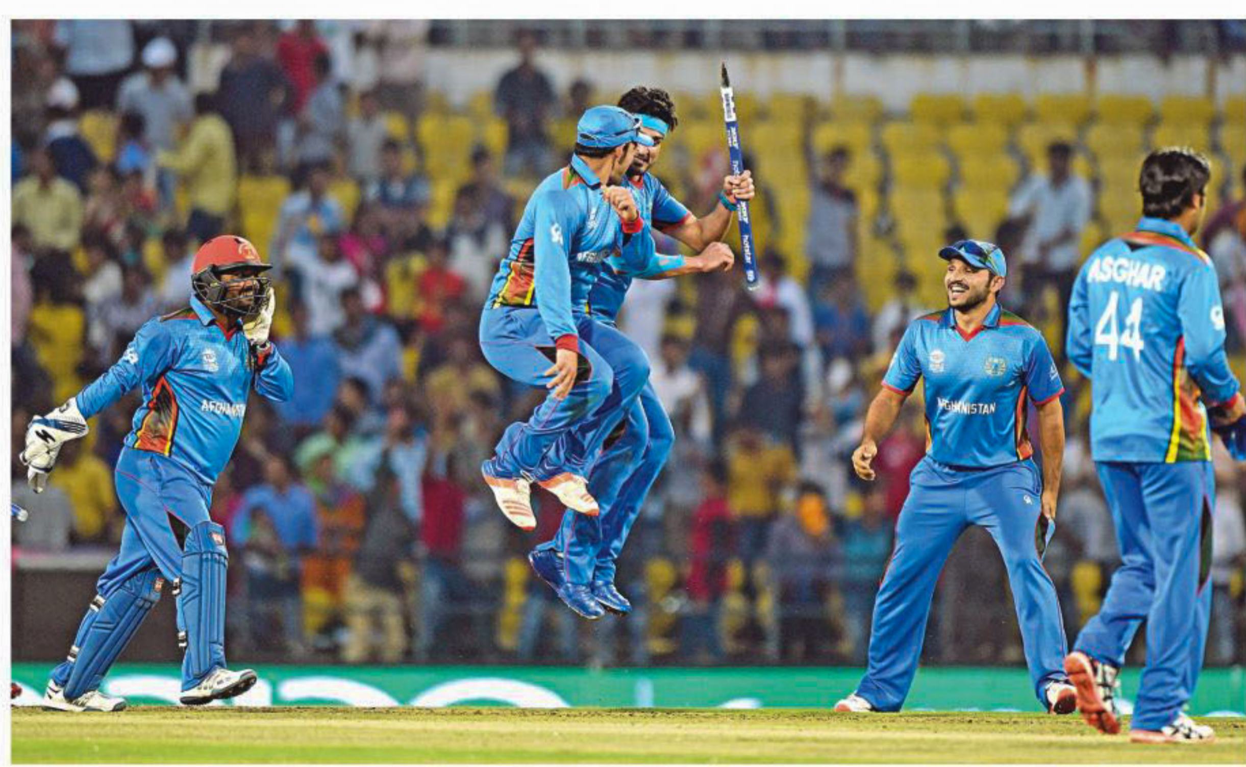
The Afghans ended their World Twenty20 campaign on a high, claiming their first win of the Super 10 and handing the West Indies their first defeat of the tournament in Nagpur yesterday.

Willey, meanwhile, who took 2-26, was fined 15 percent of his fee after giving a colourful send-off to Milinda Siriwardana when the Sri Lankan was dismissed immediately after hitting the seamer for six.