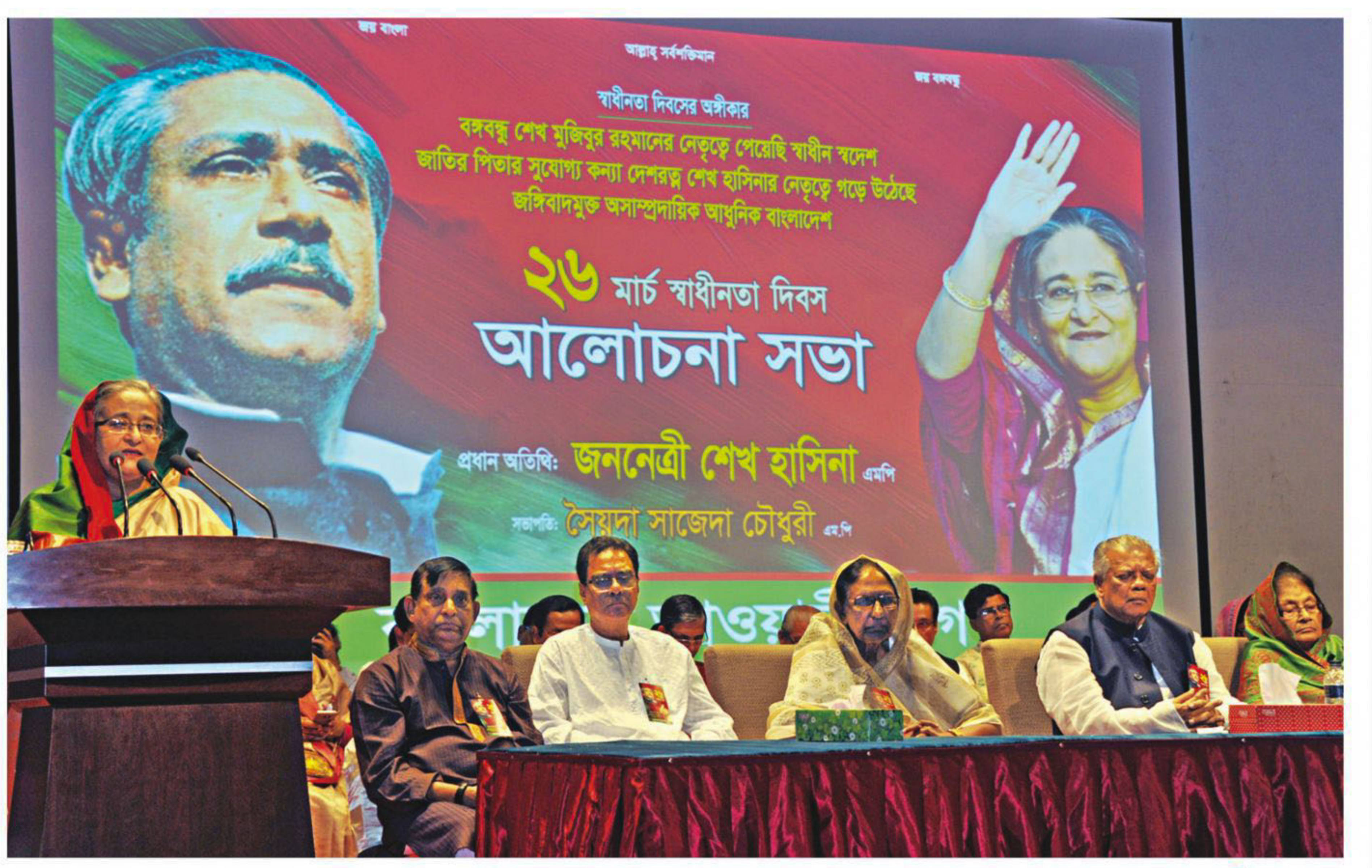
Prime Minister Sheikh Hasina speaks at a discussion organised by the Awami League at Krishibid Institution in the capital yesterday, marking the country's 46th Independence Day.

UNB, Dhaka Taking a swipe at her arch rival Khaleda Zia, Prime Minister Sheikh Hasina yesterday said the BNP chief smiles only when she can kill people. "Smile is seen on her face when she can kill people, she never flashes smile when she sees the development of people...her smile fades out when she sees smiles on people's faces," she told a discussion without mentioning Khaleda's name. Awami League organised the discussion at Krishibid Institution, Bangladesh marking the country's 46th Independence Day and National Day. Referring to an Awami League leader's comment in the discussion that there was no smile on Khaleda Zia's face when she went to place wreaths at National Memorial on March 26, the prime minister said a party leader went to the memorial and her face looked pale as there was no smile. "Where will the smile come from? All her beloved