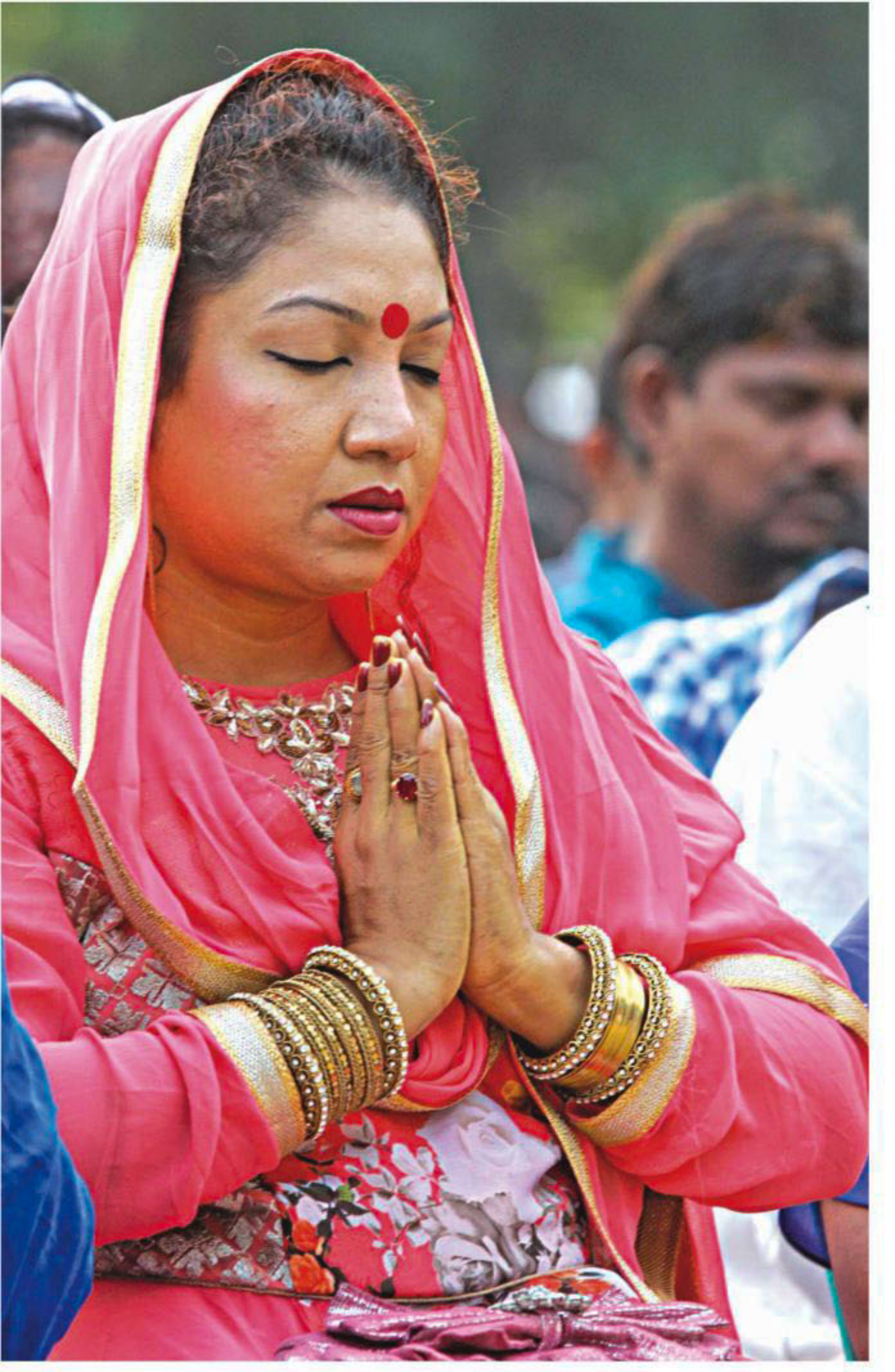
A Christian woman prays on Easter Sunday yesterday, at the T&T playground near Manik Mia Avenue in the capital. Easter is celebrated by the religious community, marking the resurrection of Jesus Christ from the dead.