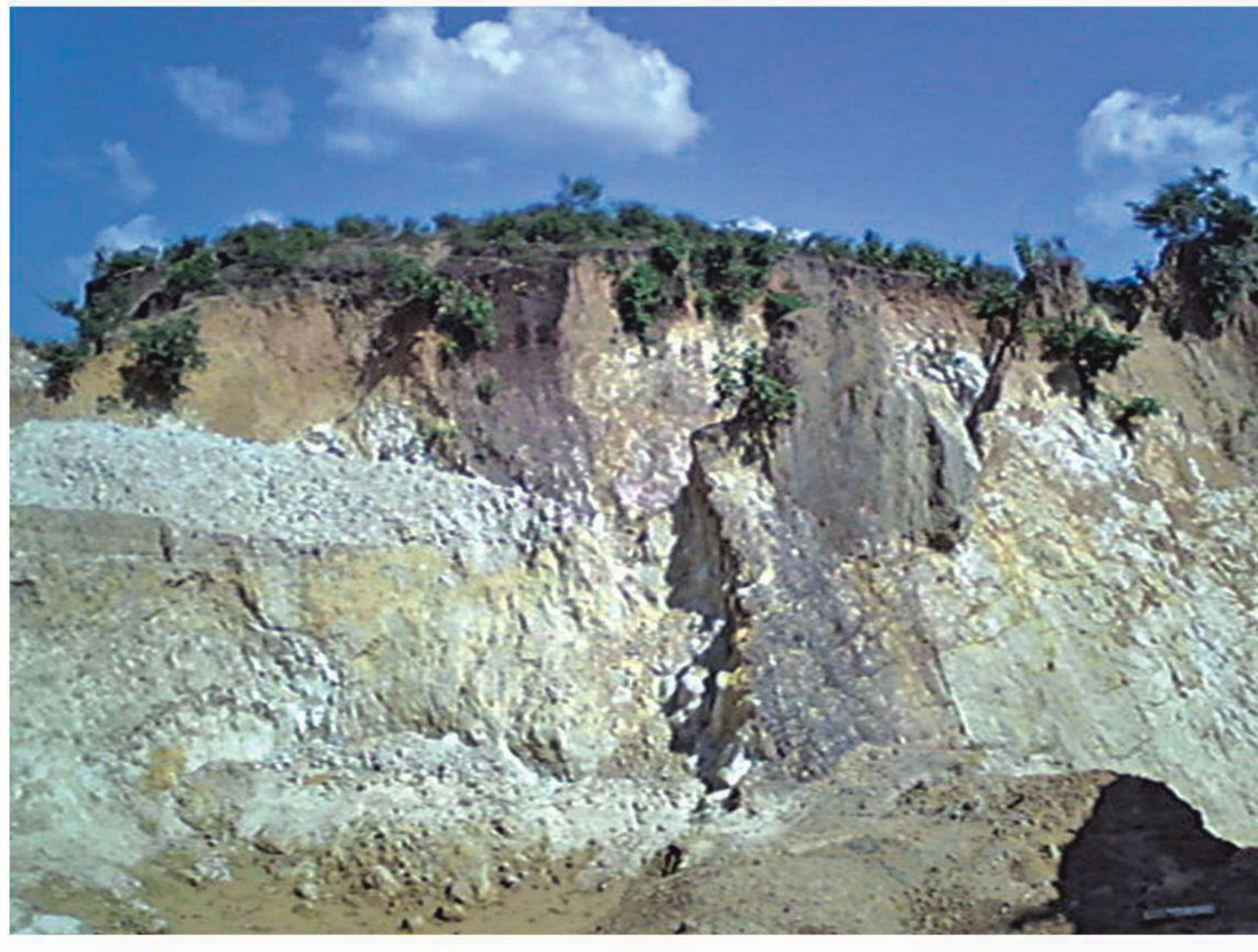
The sorry state of a hillock after loads of white clay had been extracted from it in Bhedikura area of Dhobaura in Mymensingh. The photo was taken last year.