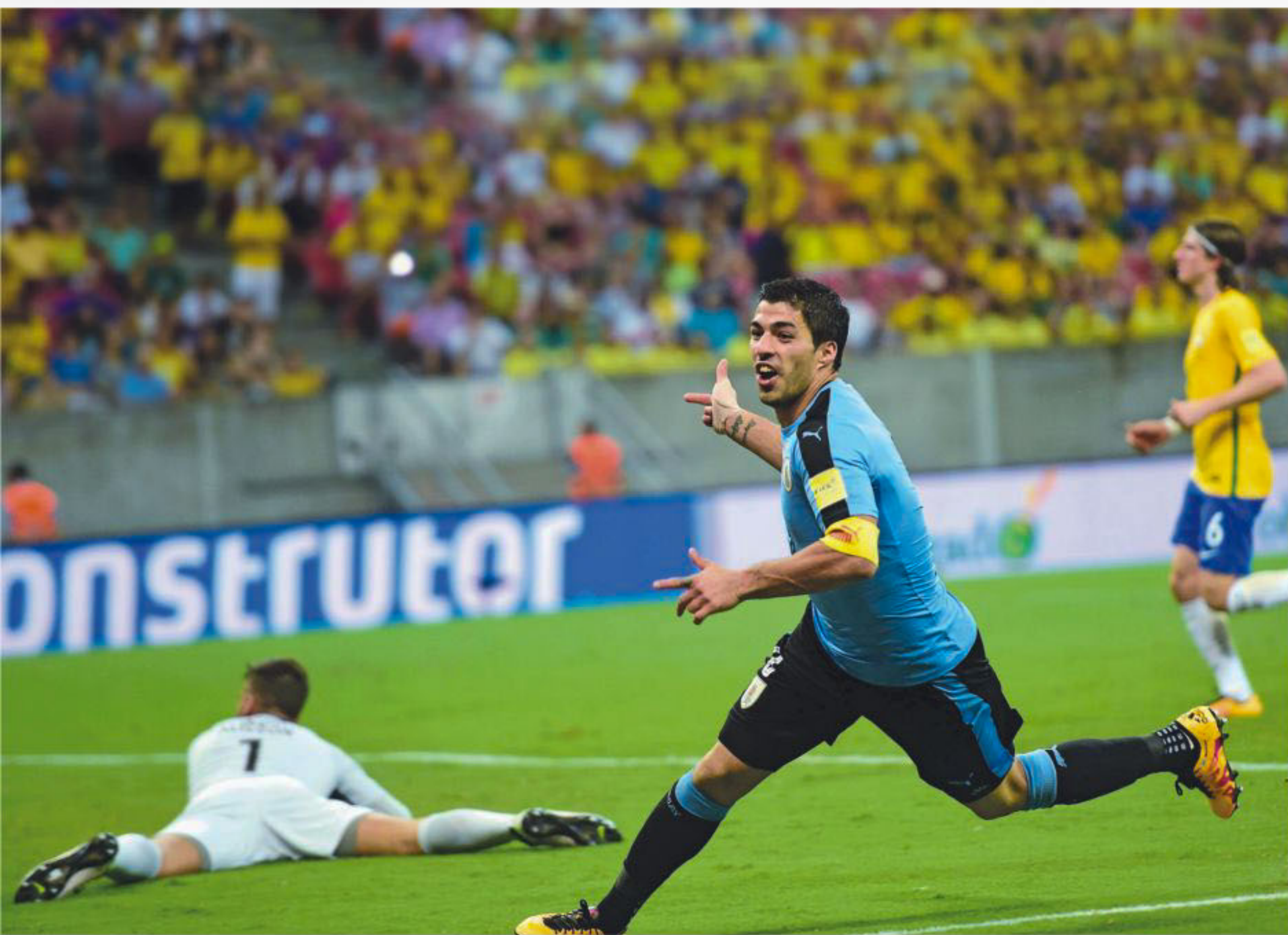
Uruguay forward Luis Suarez celebrates his equalising goal against Brazil during their FIFA World Cup qualifier in Recife on Friday. The Barcelona striker scored on his return to international football as the five-time world champions were held 2-2.