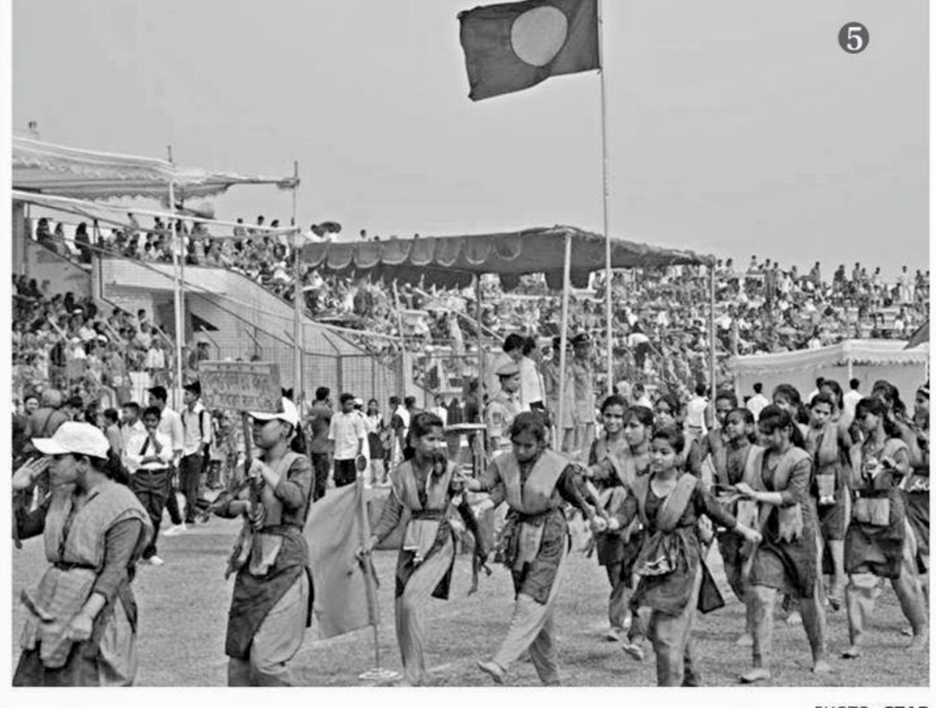
Students display artistic presentations of the Liberation War at 1) Gaibandha, 2) Chapainawabganj, and 3) Munshiganj stadiums and take part in march past at 4) Naogaon, and 5) Mymensingh stadiums as the nation celebrates the 46th Independence Day yesterday.