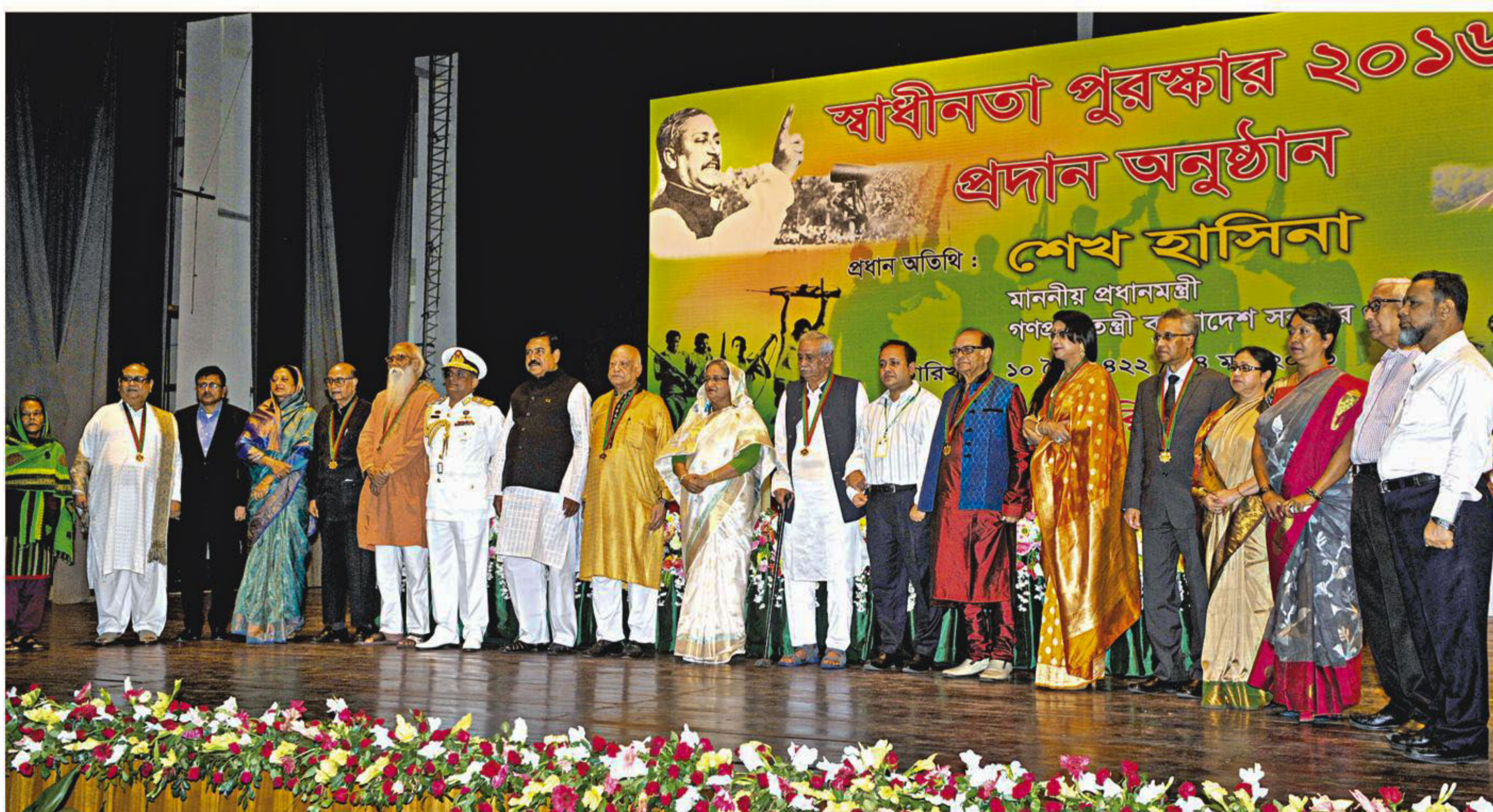
Prime Minister Sheikh Hasina poses for a photograph with the winners of Swadhinata Padak (Independence Award) 2016 and their relatives at a function at Osmani Memorial Auditorium in the capital yesterday.