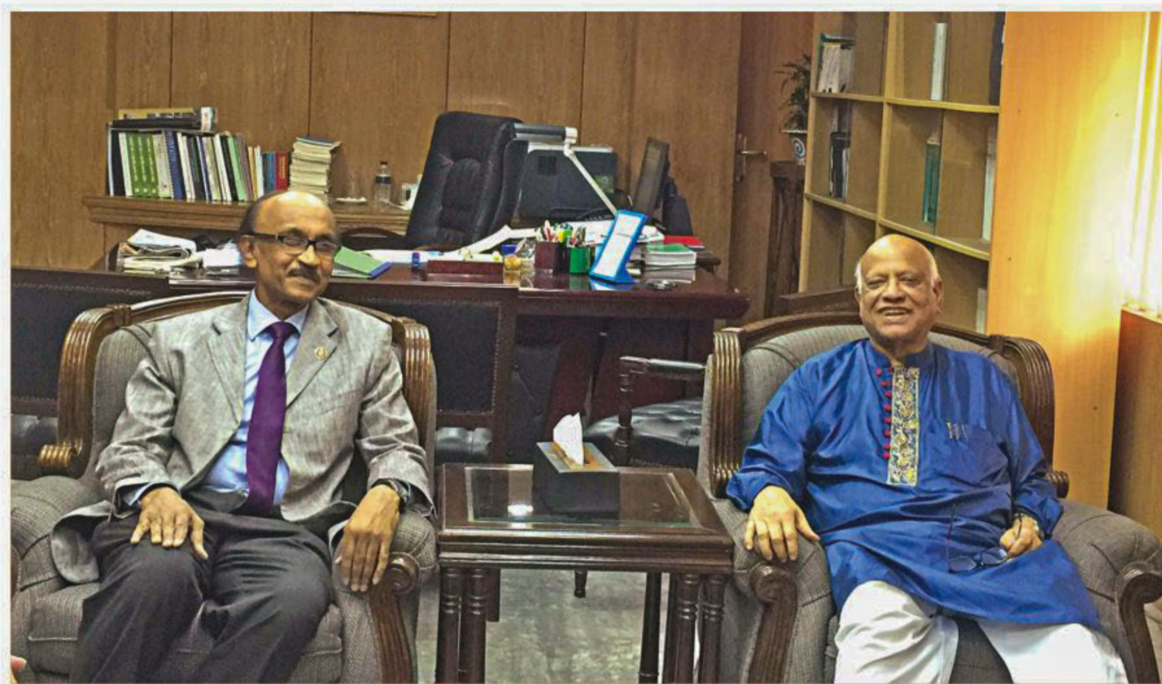
Bangladesh Bank Governor Fazle Kabir meets Finance Minister AMA Muhith at his ministry in Dhaka yesterday for the first time after Kabir took the reins of the central bank.