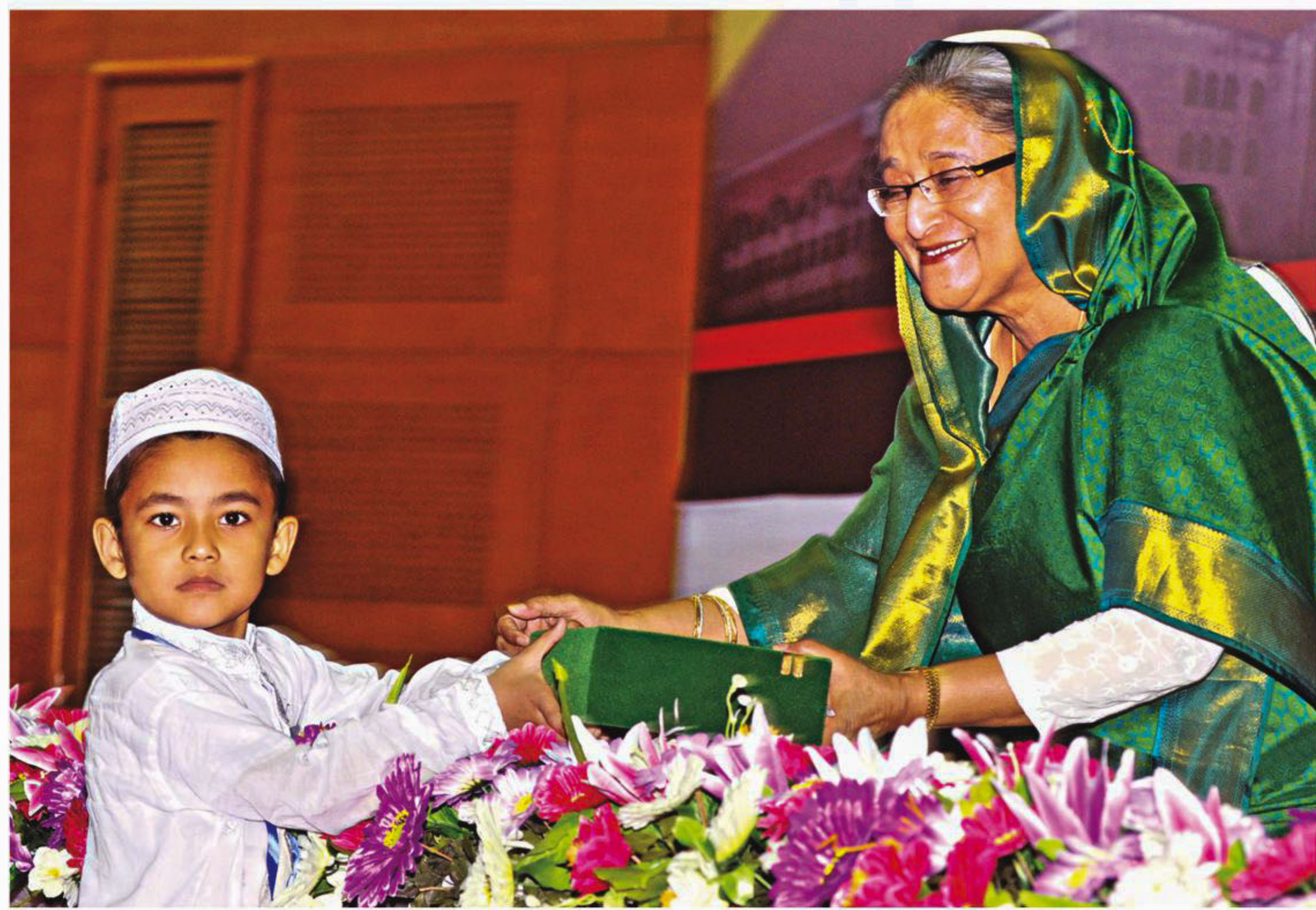
Prime Minister Sheikh Hasina hands over a copy of the Holy Quran to a child at the Bangabandhu International Conference Centre yesterday. Copies of the Holy Quran were distributed among the children of the mosque-based primary education project to mark the 41st anniversary of the Islamic Foundation.

In total, Tk 1.58 crore was recovered from his house, SEE PAGE 11 COL 3