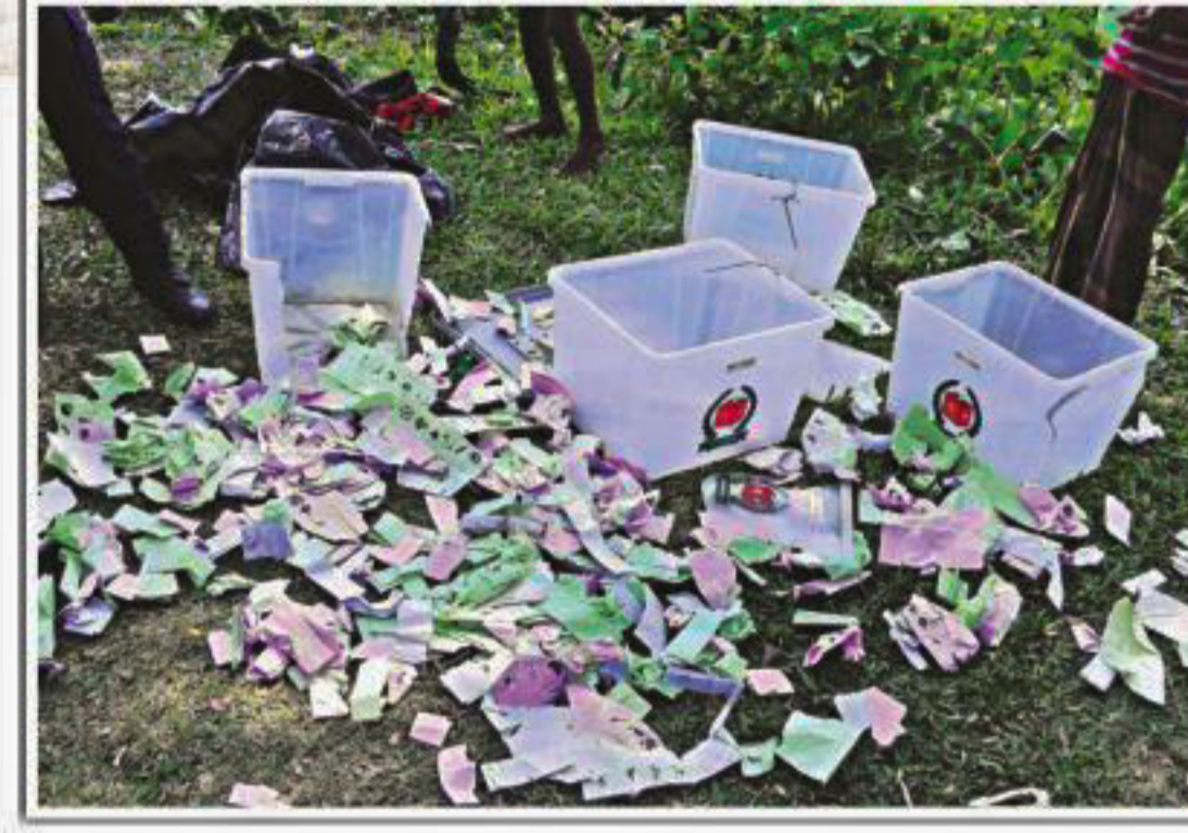
Alleged Awami League men storm a polling station in Barisal and take ballot boxes yesterday. Ballot boxes and torn up ballots after 15 to 20 people stormed the Narayanpasha Primary School polling station in Kanakdia of Patuakhali and took five boxes. The boxes were later found in a pond. More photos on page 2, 12.