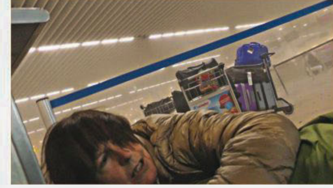
A passenger takes cover under a check-in desk moments after explosions at Brussels airport.